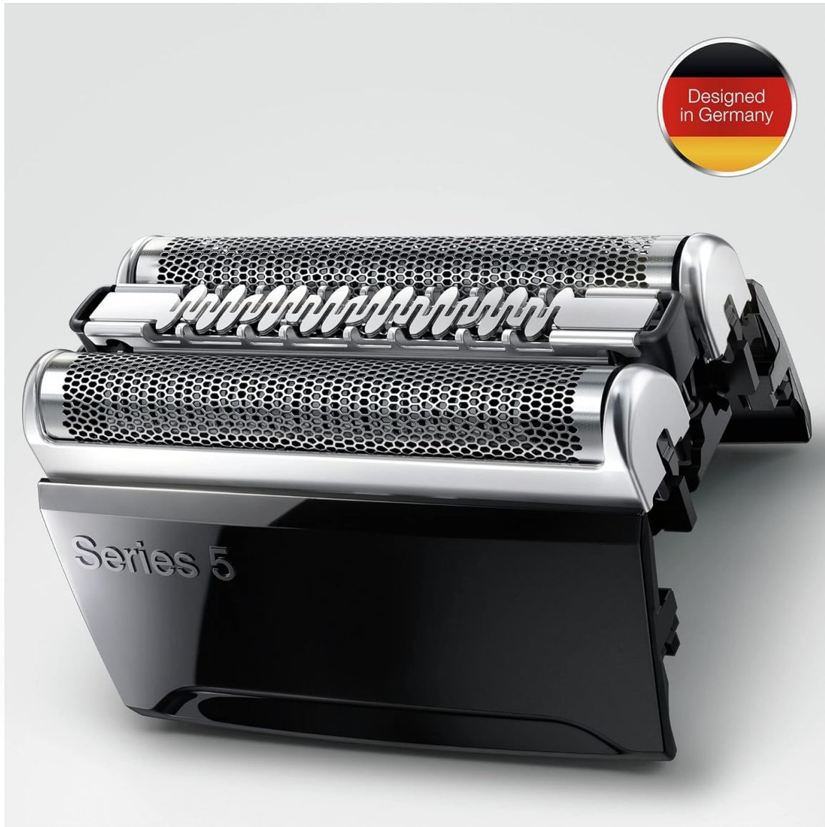
Image: The Braun Series 5 52S Replacement Head, featuring the 'Designed in Germany' emblem.