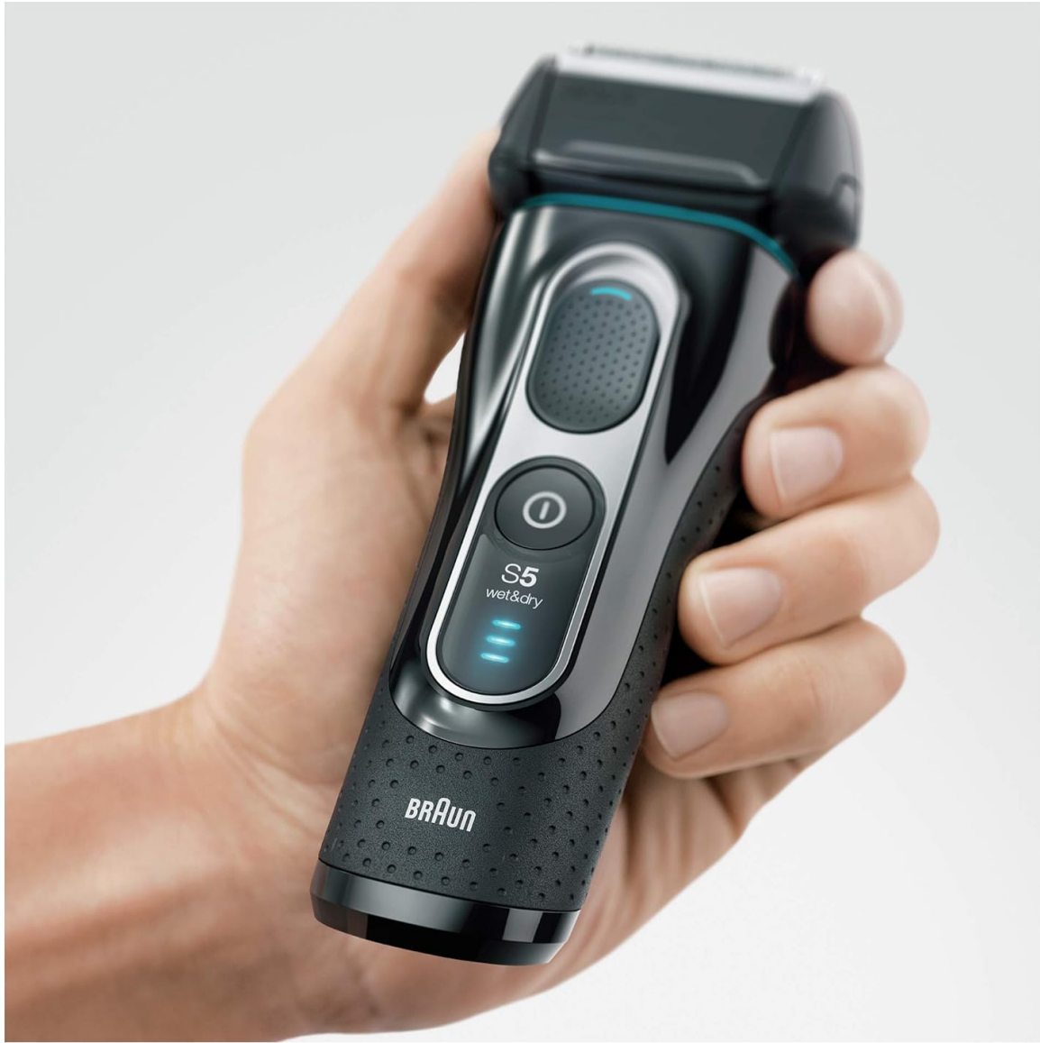
Image: A hand holding a Braun Series 5 electric shaver, demonstrating the shaver with its head.