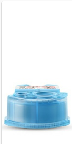
Image: Braun Clean&Charge refill cartridge, used for automatic cleaning and maintenance of compatible shavers.