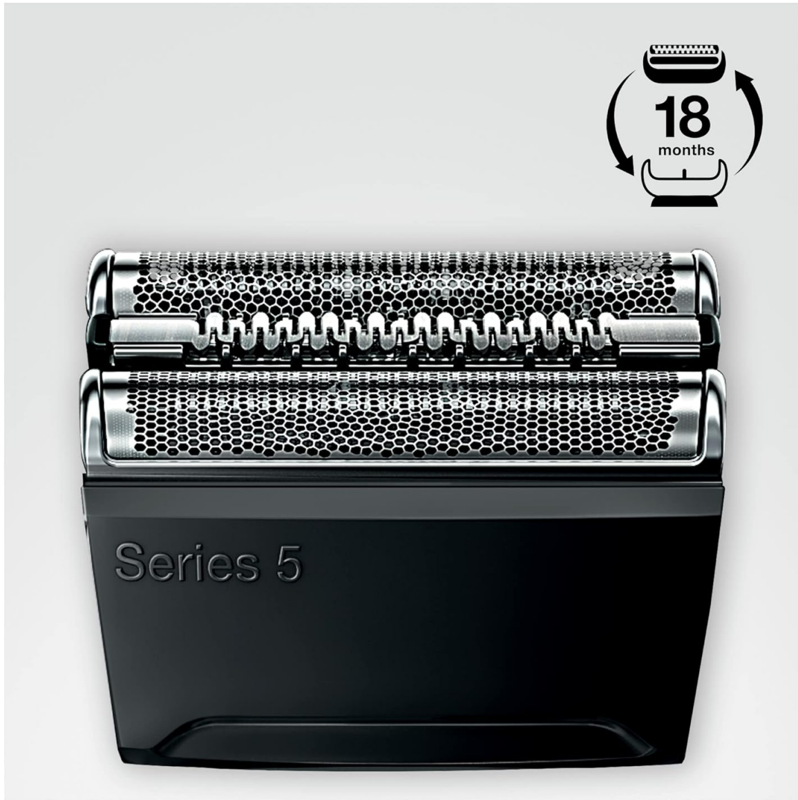
Image: The Braun Series 5 52S Replacement Head, emphasizing the recommended 18-month replacement cycle.