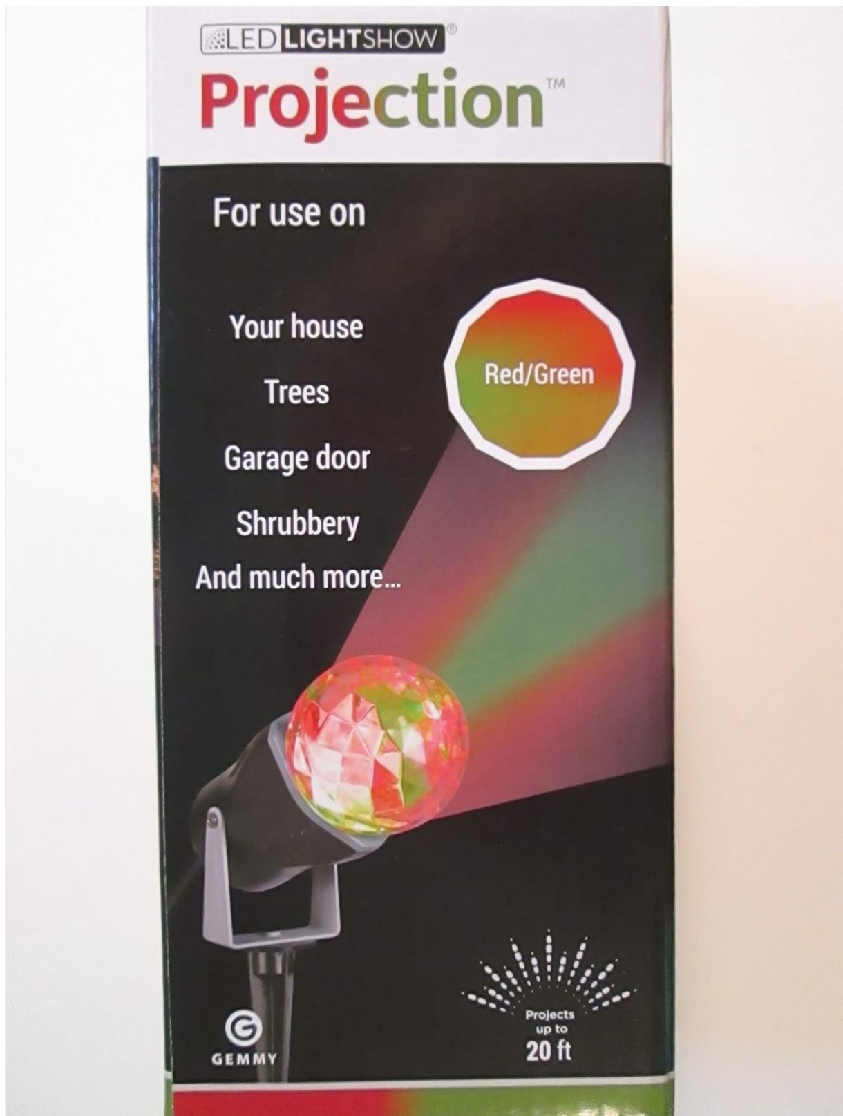
Figure 4.1: Product packaging illustrating potential projection surfaces.