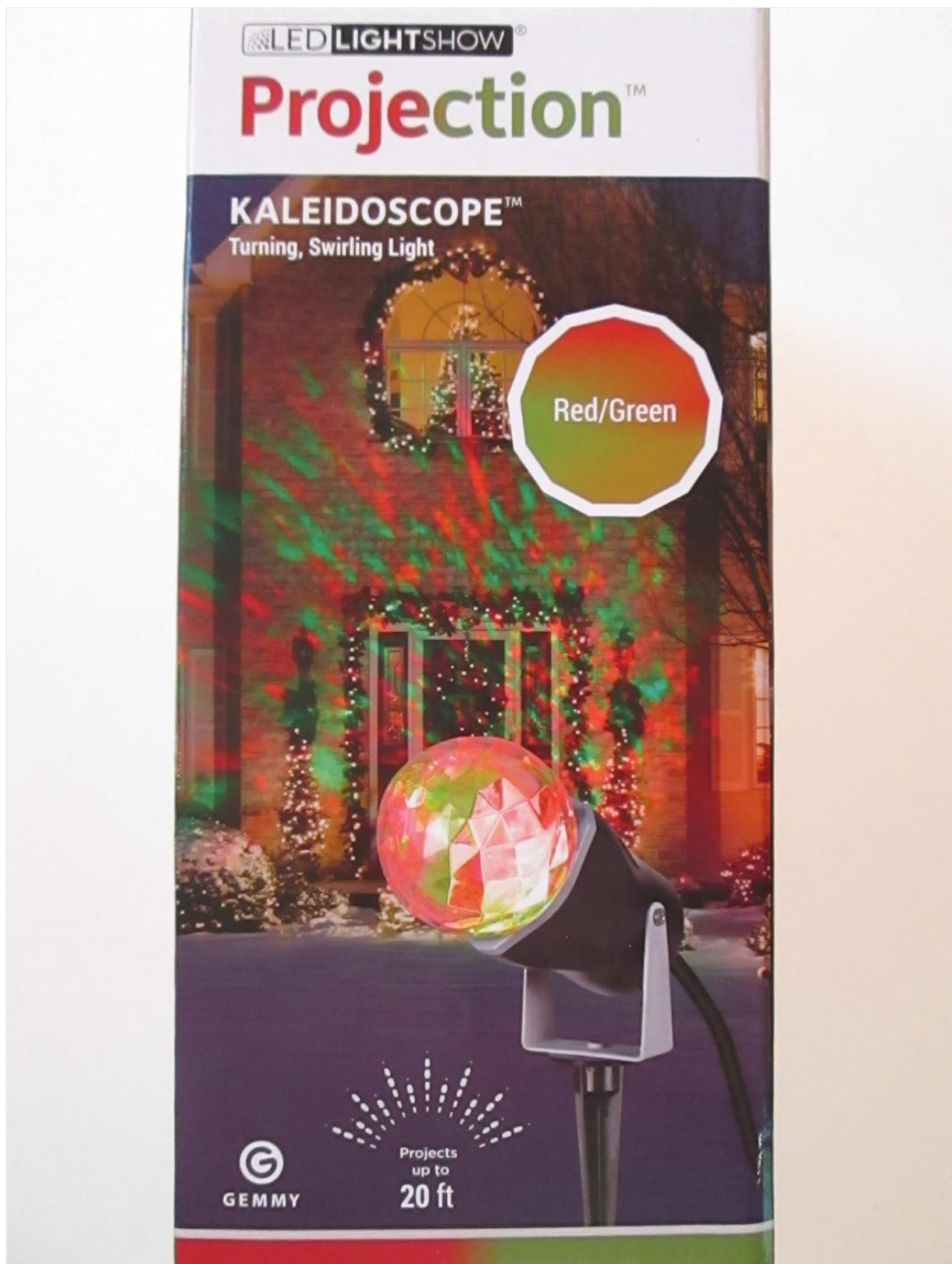
Figure 3.1: Front of the product packaging, illustrating the projector and its light display.