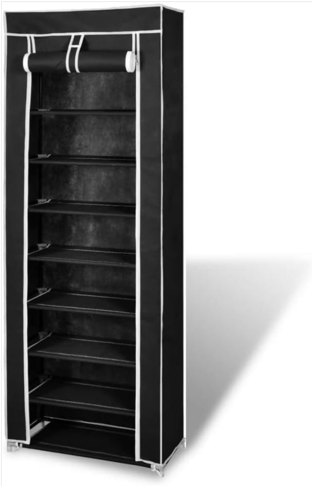
Image: The fully assembled 8-tier fabric shoe cabinet with its black cover zipped closed, providing a neat and enclosed storage solution.