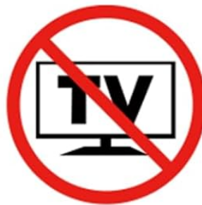
Image: Safety warning regarding furniture tip-over. It illustrates the danger of unsecured furniture and the importance of using anchor devices. It also advises against allowing children to climb on furniture, opening multiple drawers, and placing heavy items high up. A specific warning against placing a TV on the furniture is also included.