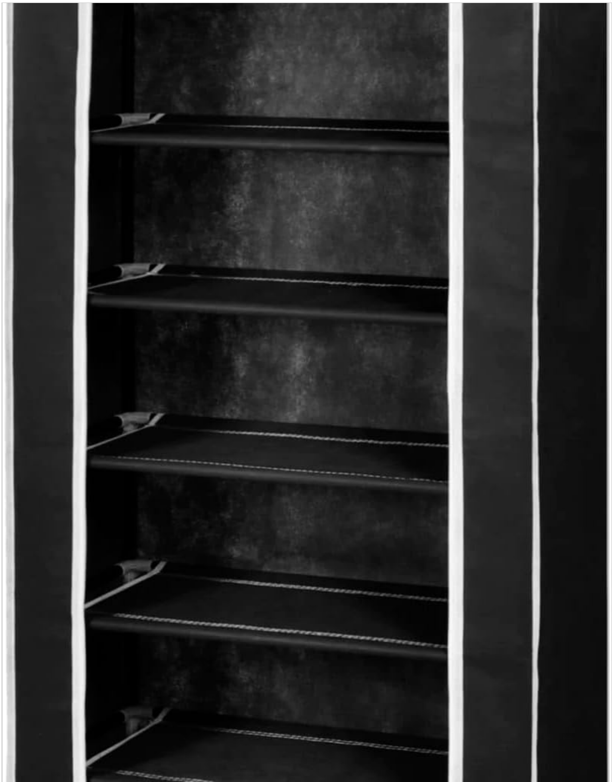
Image: A close-up view of the interior shelves of the shoe cabinet, demonstrating the eight tiers designed for organizing shoes.