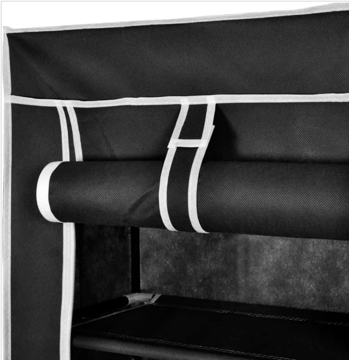
Image: Detail of the roll-up door feature, illustrating how the front fabric panel can be rolled up and fastened with ties for easy access to the shelves.

before attempting to move it to prevent damage or injury.