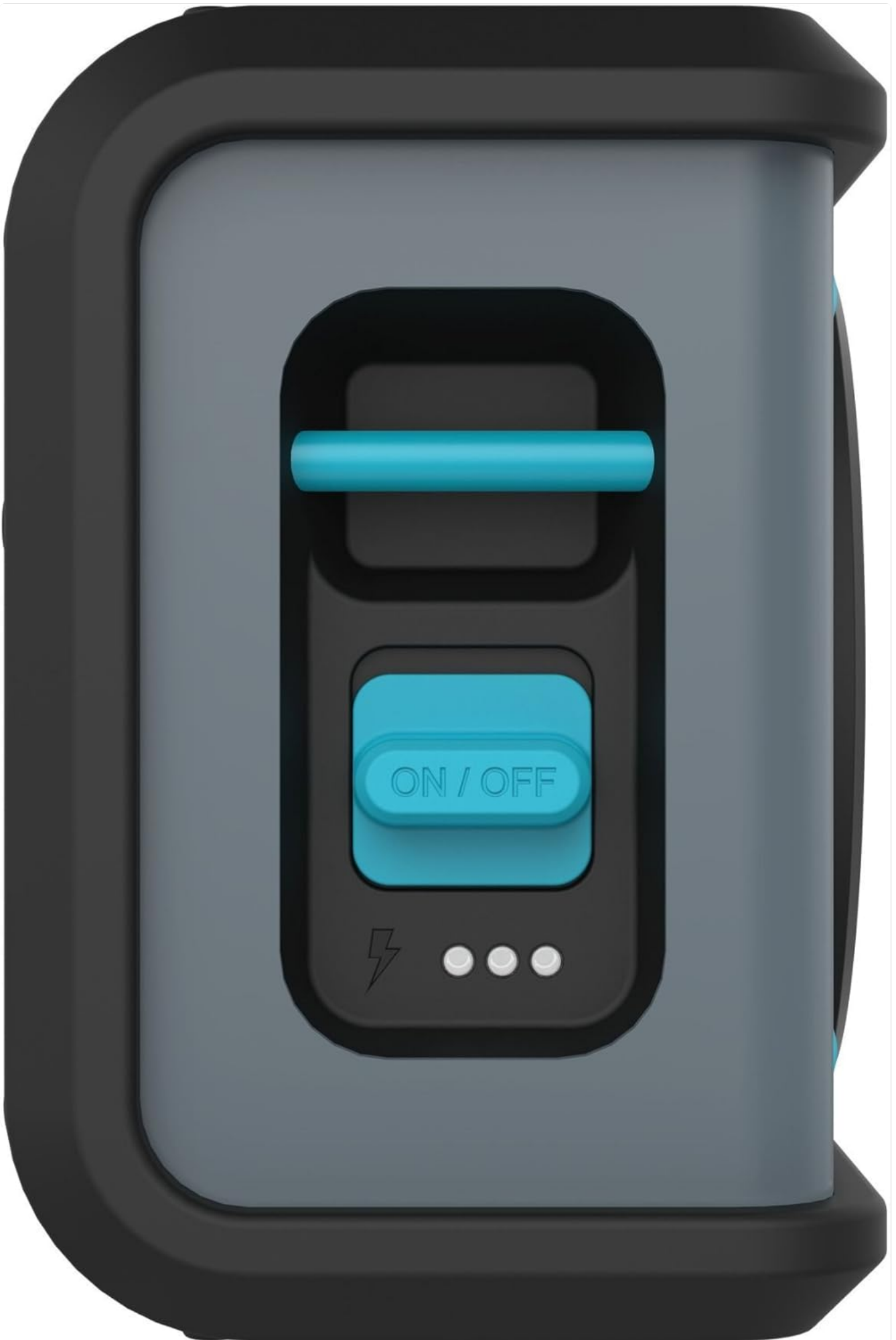
Figure 2: Side view of the speaker, highlighting the power switch and battery indicator lights near the charging port.