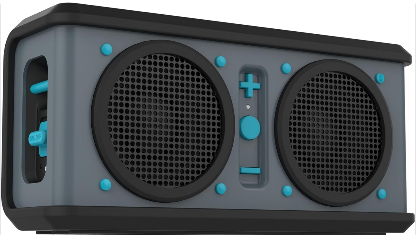
Figure 1: Front view of the Skullcandy Air Raid speaker, showcasing its grey body, black speaker grilles, and vibrant blue control buttons.

The Skullcandy Air Raid is a robust, water-resistant, and drop-proof portable Bluetooth speaker engineered to deliver powerful sound in any environment. Its durable construction, featuring a stainless steel frame and rubber boot, ensures it can withstand challenging conditions, from outdoor adventures to lively parties. Designed for maximum portability and resilience, the Air Raid provides a high-quality audio experience wherever you go.