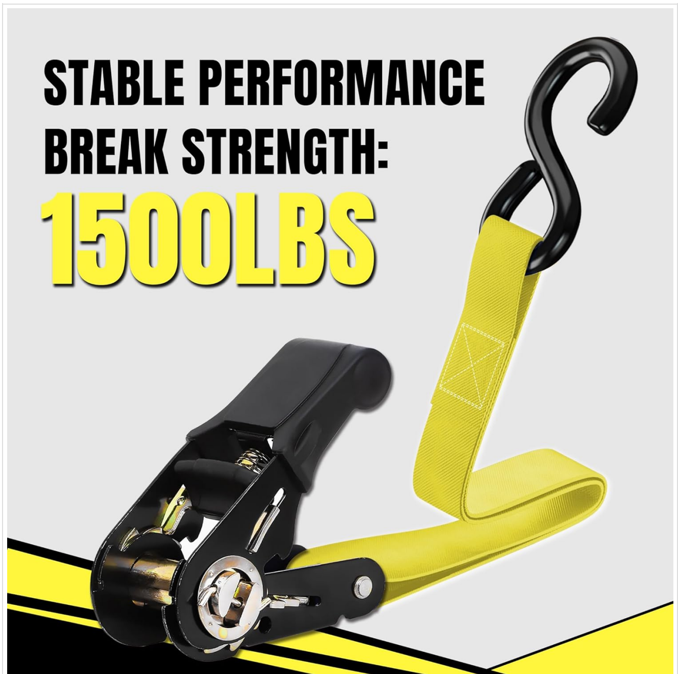
Figure 3: The tie-down strap highlighting its 1500 lbs break strength.