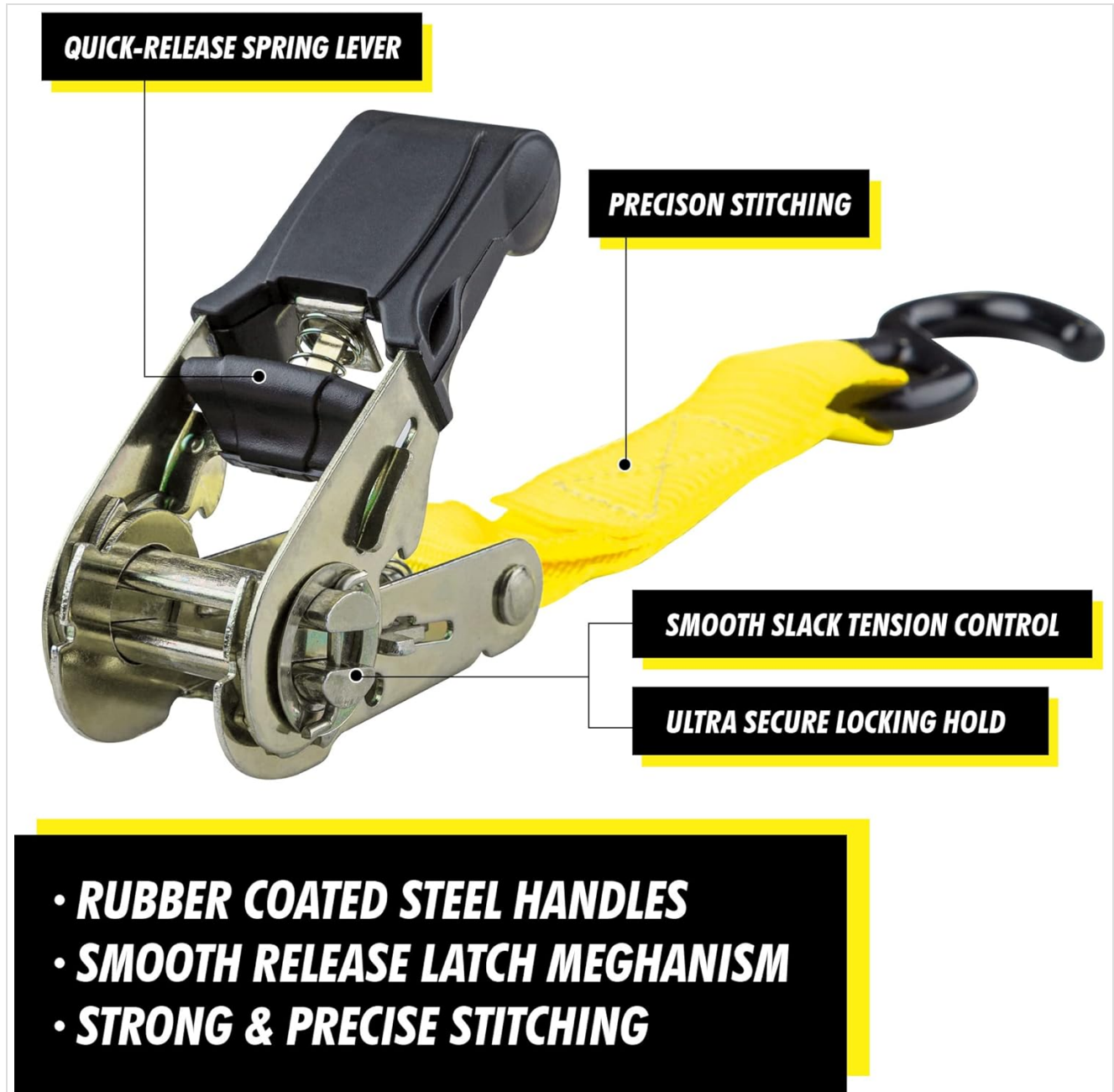
Figure 4: Detailed view of the ratchet mechanism.

Before securing your cargo, ensure the ratchet mechanism is in the open position. Pull the quick-release lever and open the ratchet handle fully until it lies flat.