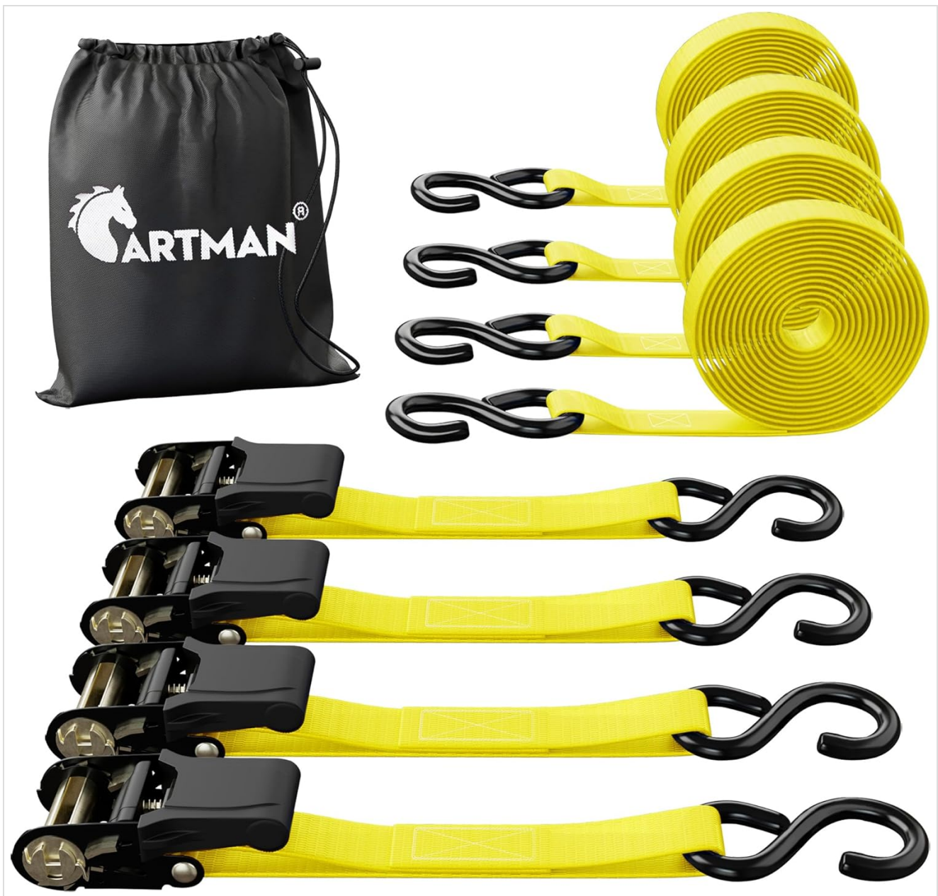
Figure 1: CARTMAN Ratchet Tie Down Straps (4-Pack).