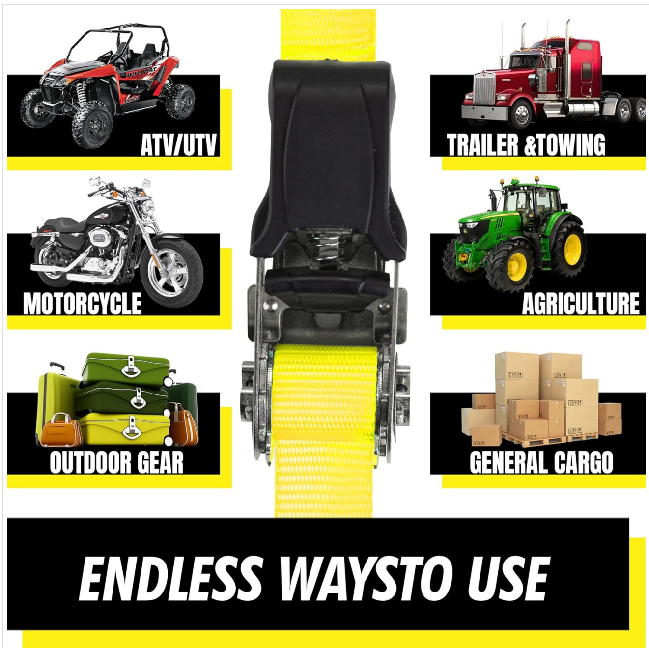
Figure 7: Examples of cargo securement applications.