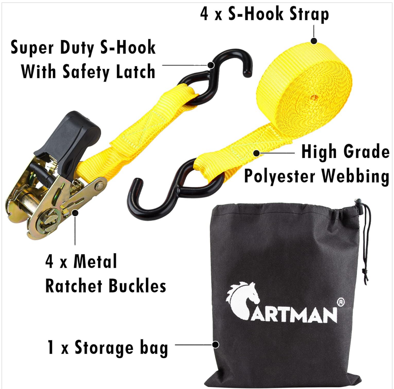
Figure 2: Included components of the CARTMAN Ratchet Tie Down Straps set.