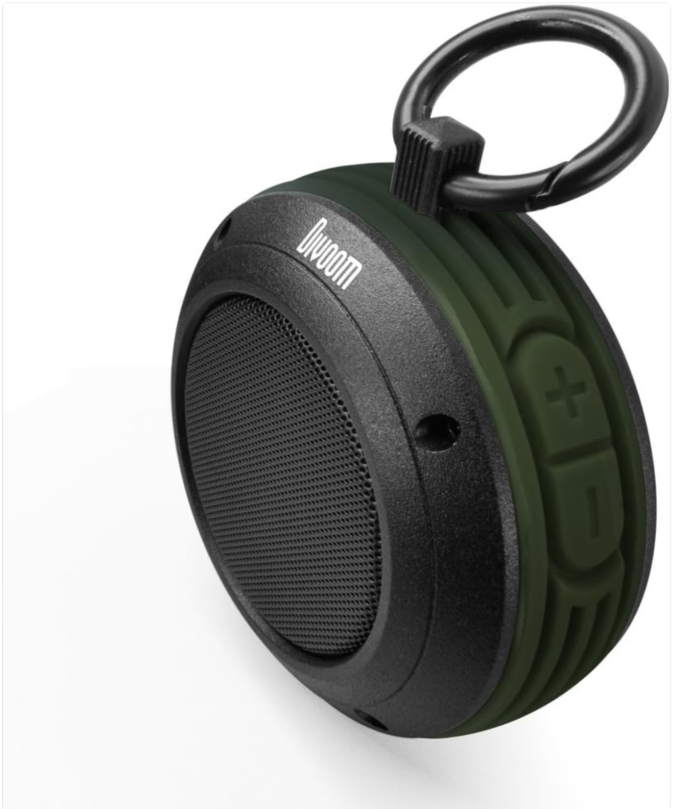
Side view illustrating the power button and call answer/end button, designed for easy access and tactile feedback.