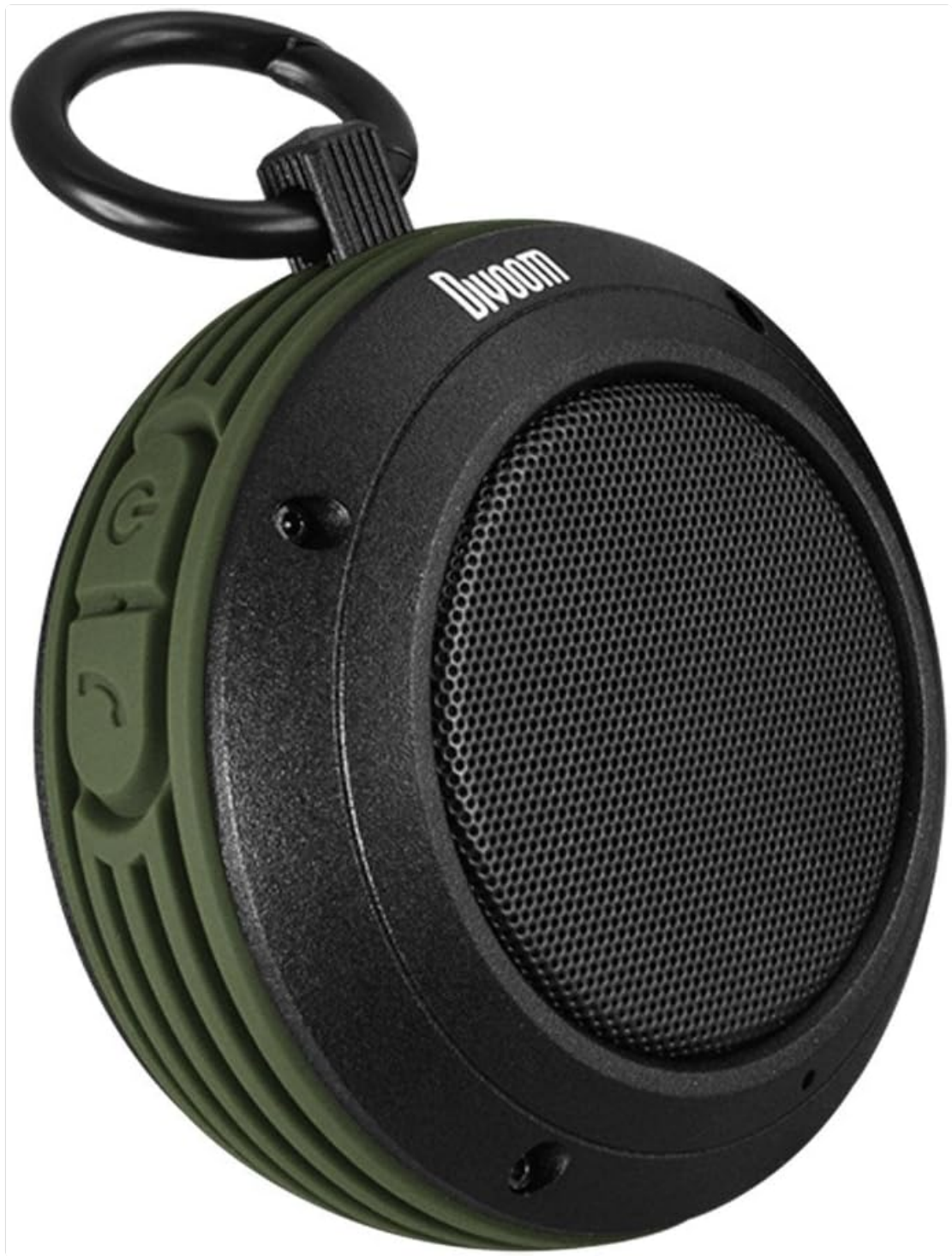
Front view of the Divoom Voombox Travel speaker, showcasing its compact, rugged design and integrated carabiner for easy portability.