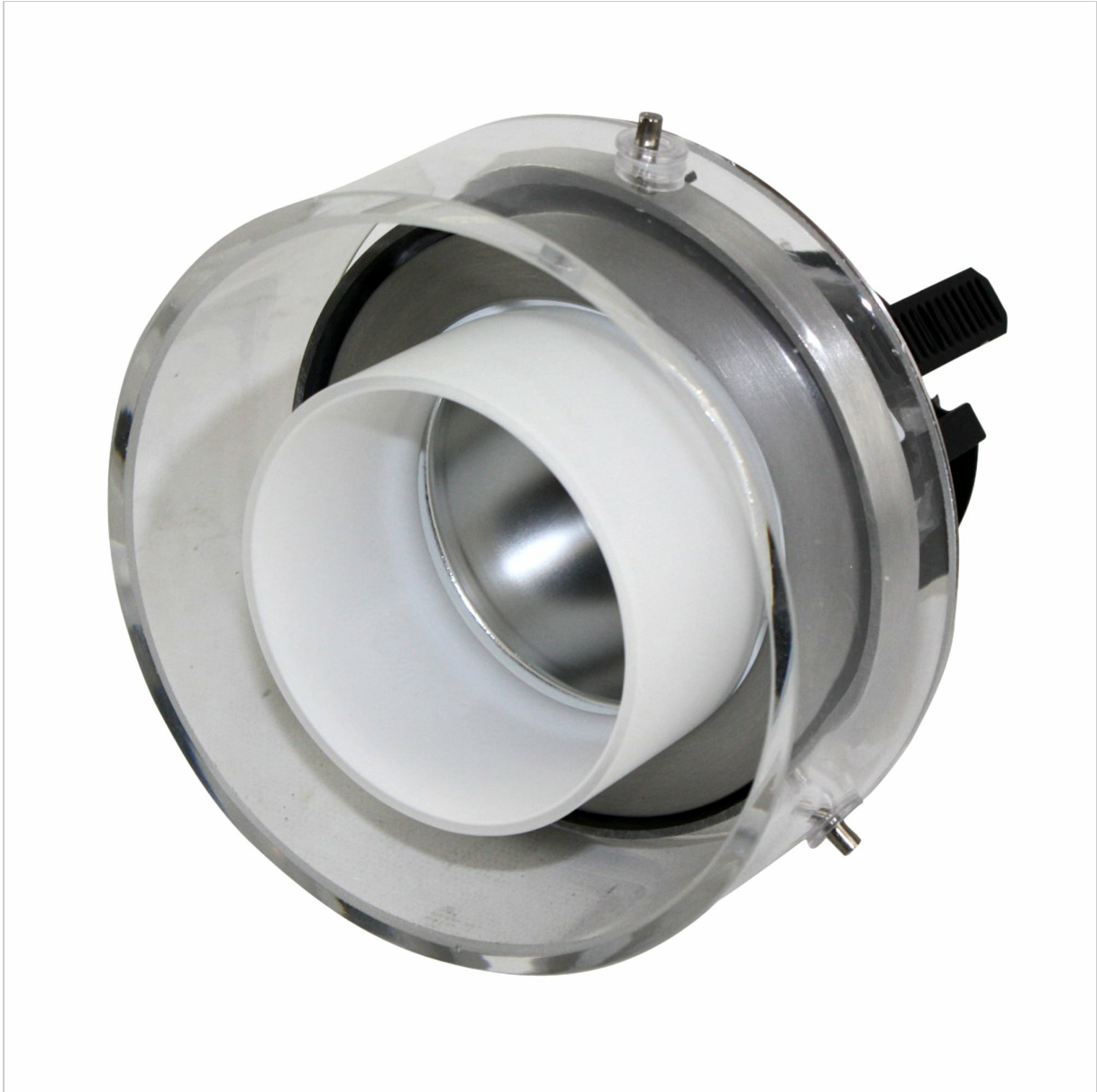
Image 1: Assembled Lightolier D3MR14 recessed downlight. This view shows the clear outer glass and the internal components.