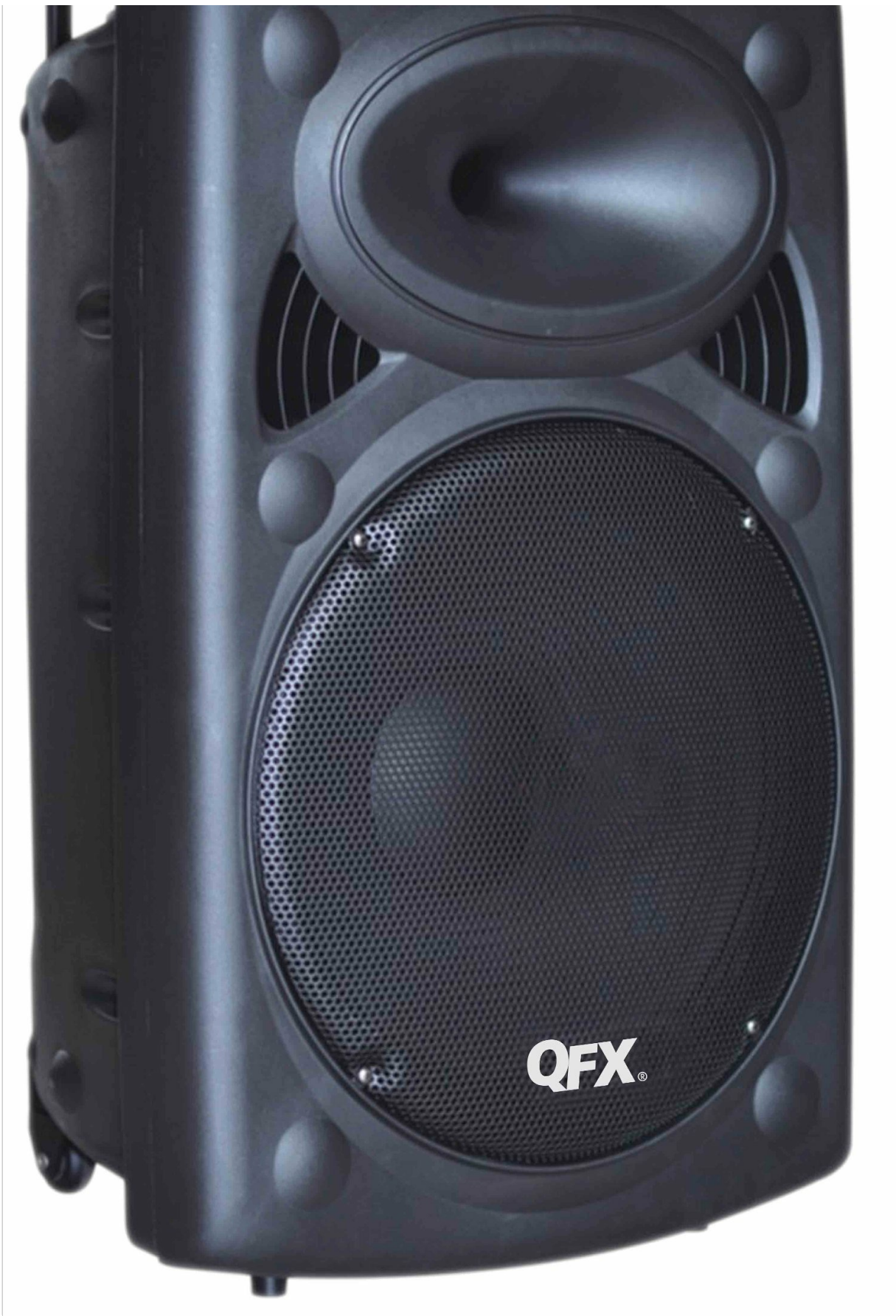
Image 1: Front view of the QFX PBX-61120BT Portable Bluetooth Speaker. This image displays the main 12-inch woofer behind a protective metal grill, the control panel typically located on the top or side, and the integrated wheels and extendable handle for portability.

The speaker unit includes a main control panel, typically located on the top or rear, which houses buttons for power, mode selection, volume control, and input ports. The rear or side features an extendable handle and wheels for convenient transportation.