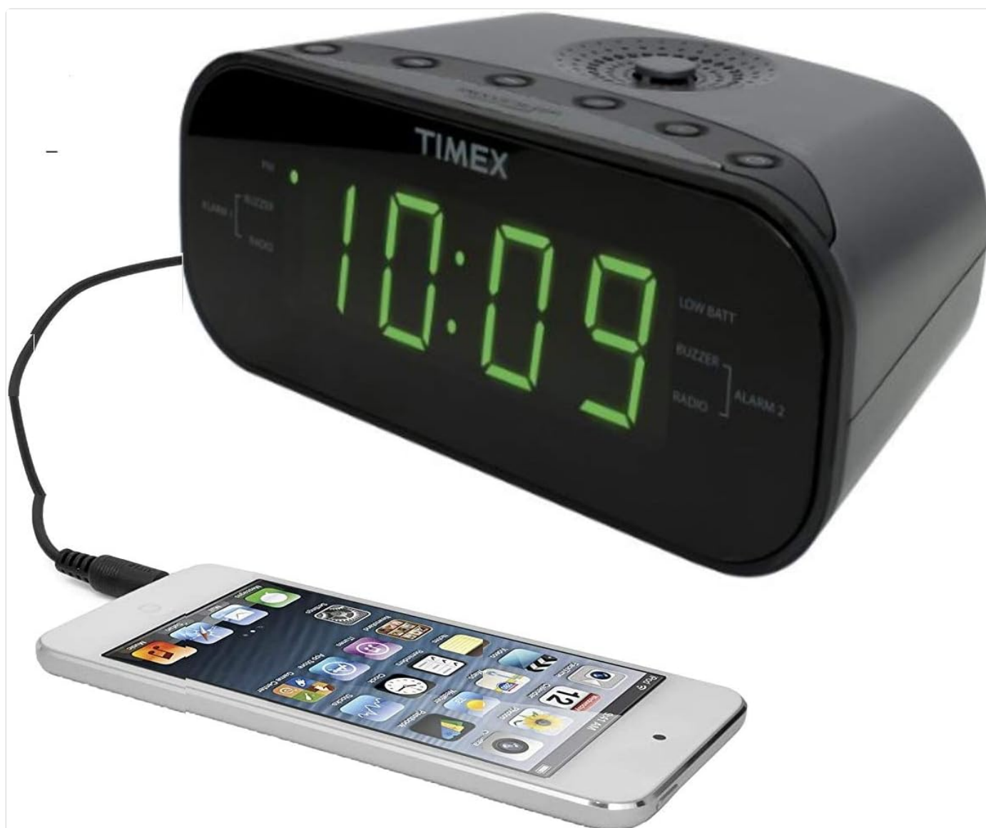
Figure 2: The Timex T235WY with an external device connected to its auxiliary input, demonstrating media playback capability.

Connect an external audio device (e.g., smartphone, MP3 player) to the AUX IN jack on the back of the unit using a 3.5mm audio cable (not included). The audio from the connected device will play through the clock radio's speaker.