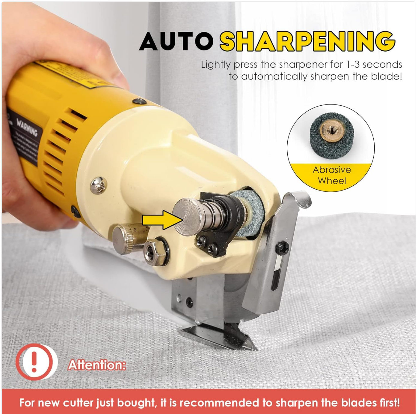
Figure 8: The powerful motor allows cutting of various materials including leather, cloth, fabric, chiffon, and carpet.