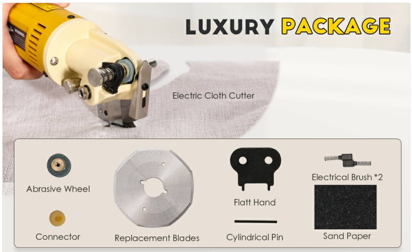
Figure 2: View of the included accessories and components in the package.