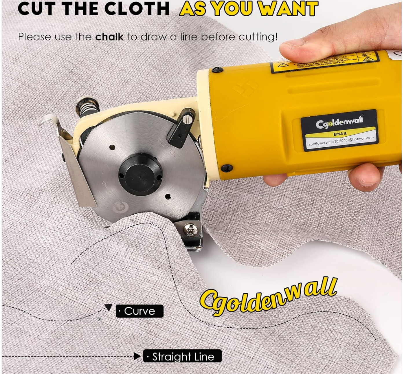
Figure 1: CGOLDENWALL Electric Rotary Fabric Cutter, a powerful tool for cutting various materials.

Please use the chalk to draw a line before cutting!