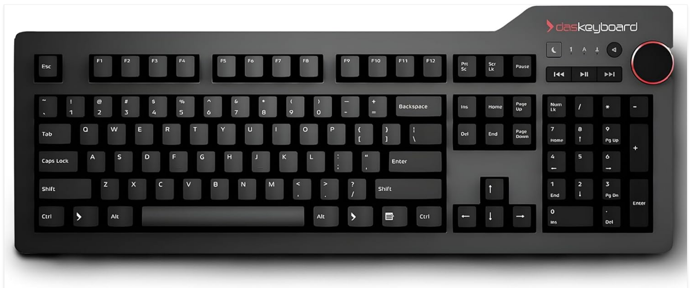
Figure 1: Top-down view of the Das Keyboard 4 Professional, showcasing its full layout including the numeric keypad and media controls.

The Das Keyboard 4 Professional is a high-performance mechanical keyboard designed for an exceptional typing experience. It features Cherry MX Brown mechanical switches, a 2-port USB 3.0 hub, dedicated media controls with an oversized volume knob, and a durable aluminum top panel. This manual provides essential information for setting up, operating, maintaining, and troubleshooting your keyboard.