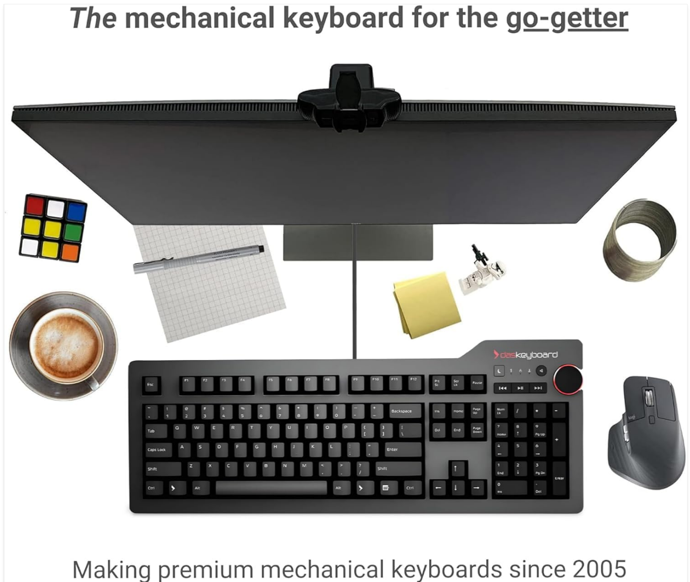
Figure 2: The Das Keyboard 4 Professional shown with its magnetic footbar ruler, which can be attached to elevate the keyboard for ergonomic typing.