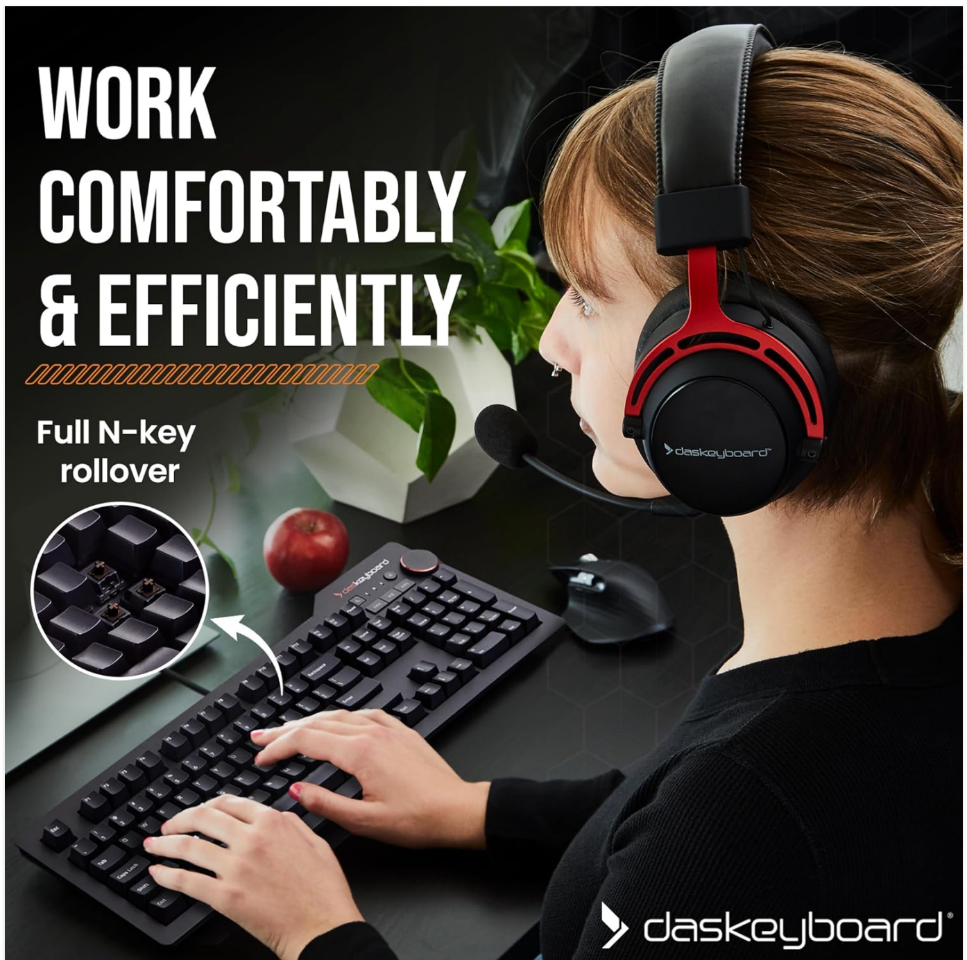
Figure 6: A user demonstrating comfortable and efficient typing on the Das Keyboard 4 Professional, highlighting the benefit of full N-key rollover for fast input.