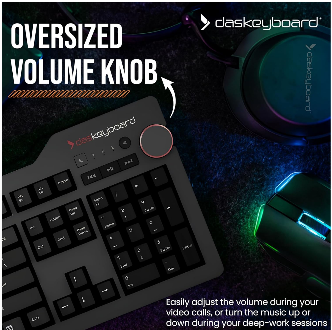
Figure 4: Detail of the oversized volume knob and dedicated media control buttons on the Das Keyboard 4 Professional, designed for easy access.