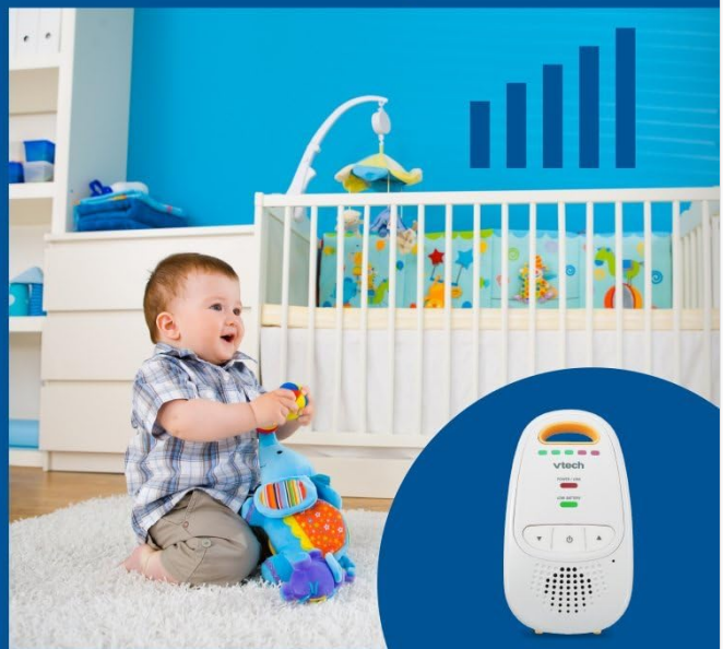
5-level sound indicator

The Parent Unit displaying its key features: secure digital transmission, power light, volume control buttons, and a 5-level sound indicator.