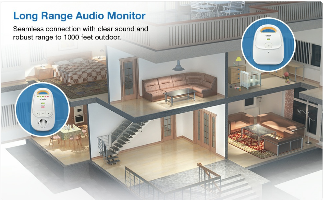
Illustration of the monitor's long range capability, covering up to 1,000 feet outdoors.

Seamless connection with clear sound and robust range to 1000 feet outdoor.