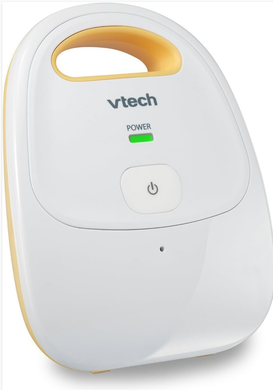
Front view of the Baby Unit, showing the power indicator and microphone.

The Baby Unit is placed in your baby's room and transmits audio to the Parent Unit. It features a power indicator and a microphone.