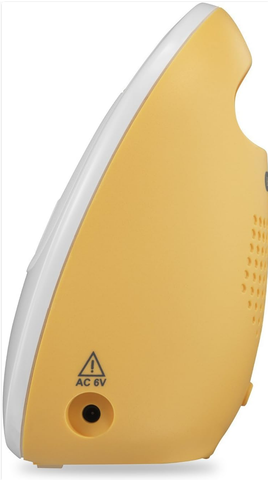
Side view of the Baby Unit, highlighting the AC power adapter port.