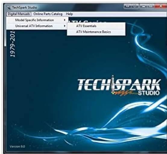
Figure 3.1: Screenshot of the TechSpark Studio software main interface, showing menu options for model-specific information and universal ATV information.