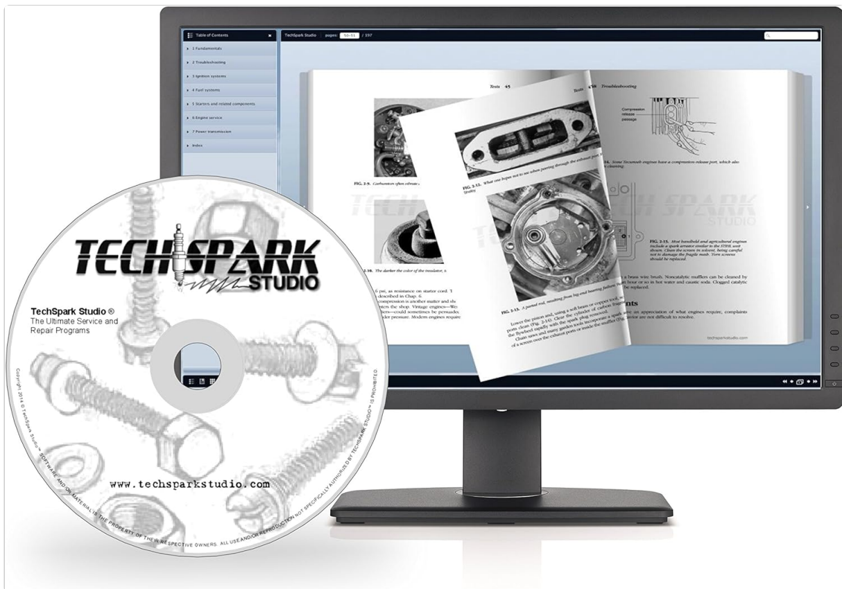
Figure 2.1: The TechSpark Studio CD-ROM alongside a monitor displaying the digital service manual interface, showing detailed diagrams and text.