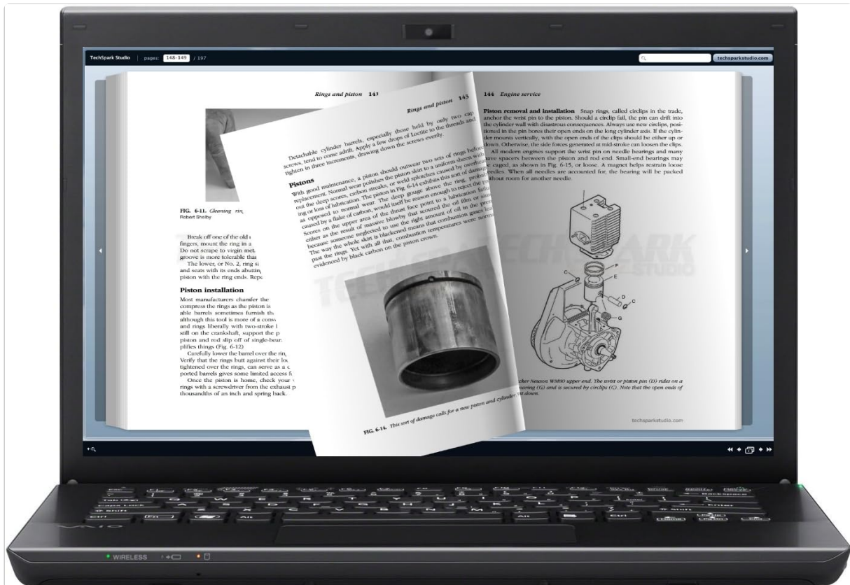
Figure 4.1: A laptop displaying the digital manual, illustrating the flipping book interface with detailed engine component diagrams.