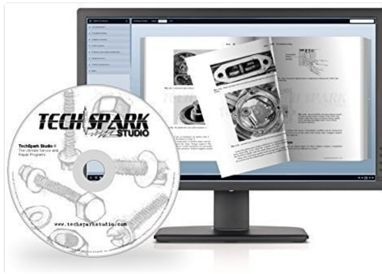
Figure 2.1: The TechSpark Studio CD-ROM alongside a monitor displaying the digital manual interface. This image illustrates the physical media and the software's visual presentation.