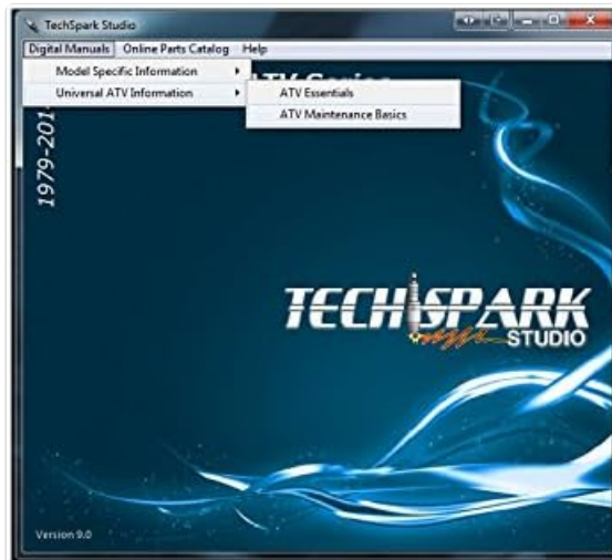
Figure 5.1: A screenshot of the TechSpark Studio software's main interface, showing the menu bar with options like 'Digital Manuals', 'Online Parts Catalog', and 'Help'. This image provides a visual reference for navigating the software's features.