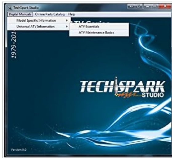
Image 2: A screenshot of the TechSpark Studio software's main interface, showing navigation options.