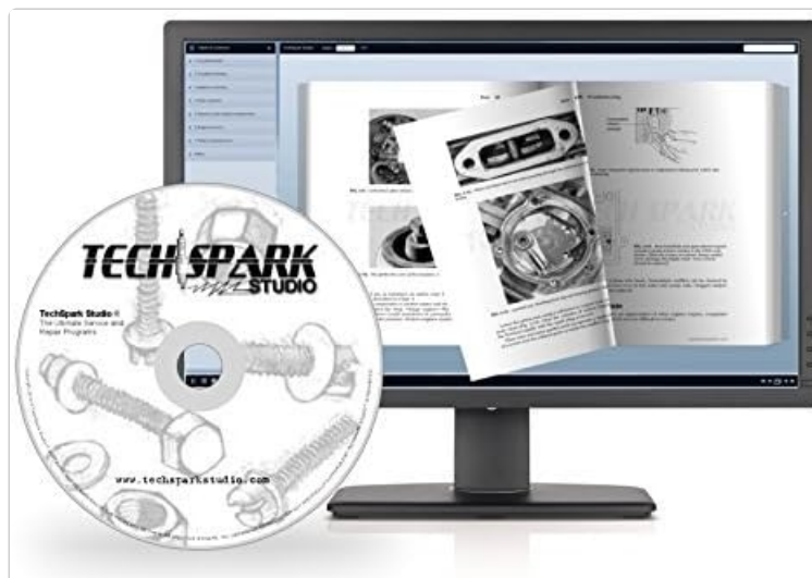
Image 1.1: The TechSpark Studio CD-ROM alongside a monitor displaying the digital service manual interface.

Unlike physical manuals, this software allows you to print specific pages or the entire manual as needed. If printed pages become soiled during use, a fresh copy can be easily generated. Additionally, the software provides quick access to an online parts catalog and complete wiring diagrams relevant to your vehicle.