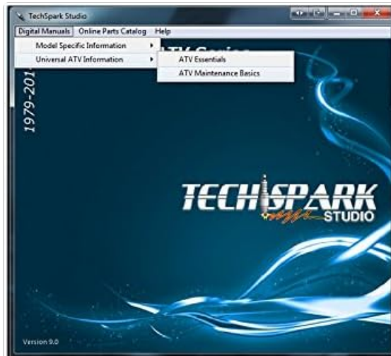
Image 2.1: The main interface of the TechSpark Studio software, showing navigation options for model-specific and universal ATV information.

The program operates directly from your computer, eliminating the need for an internet connection to access the manual content after installation.