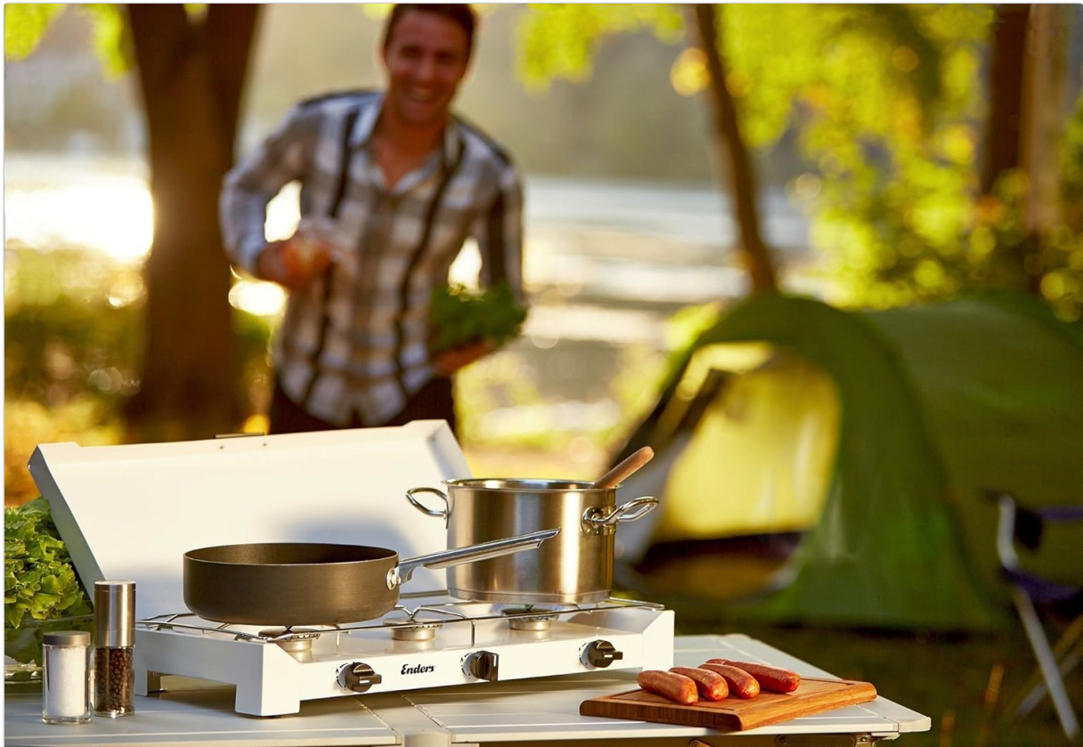
Figure 2: The Enders DALGETY 3-Burner Gas Camping Stove being used outdoors at a campsite, demonstrating its portability and cooking capacity.