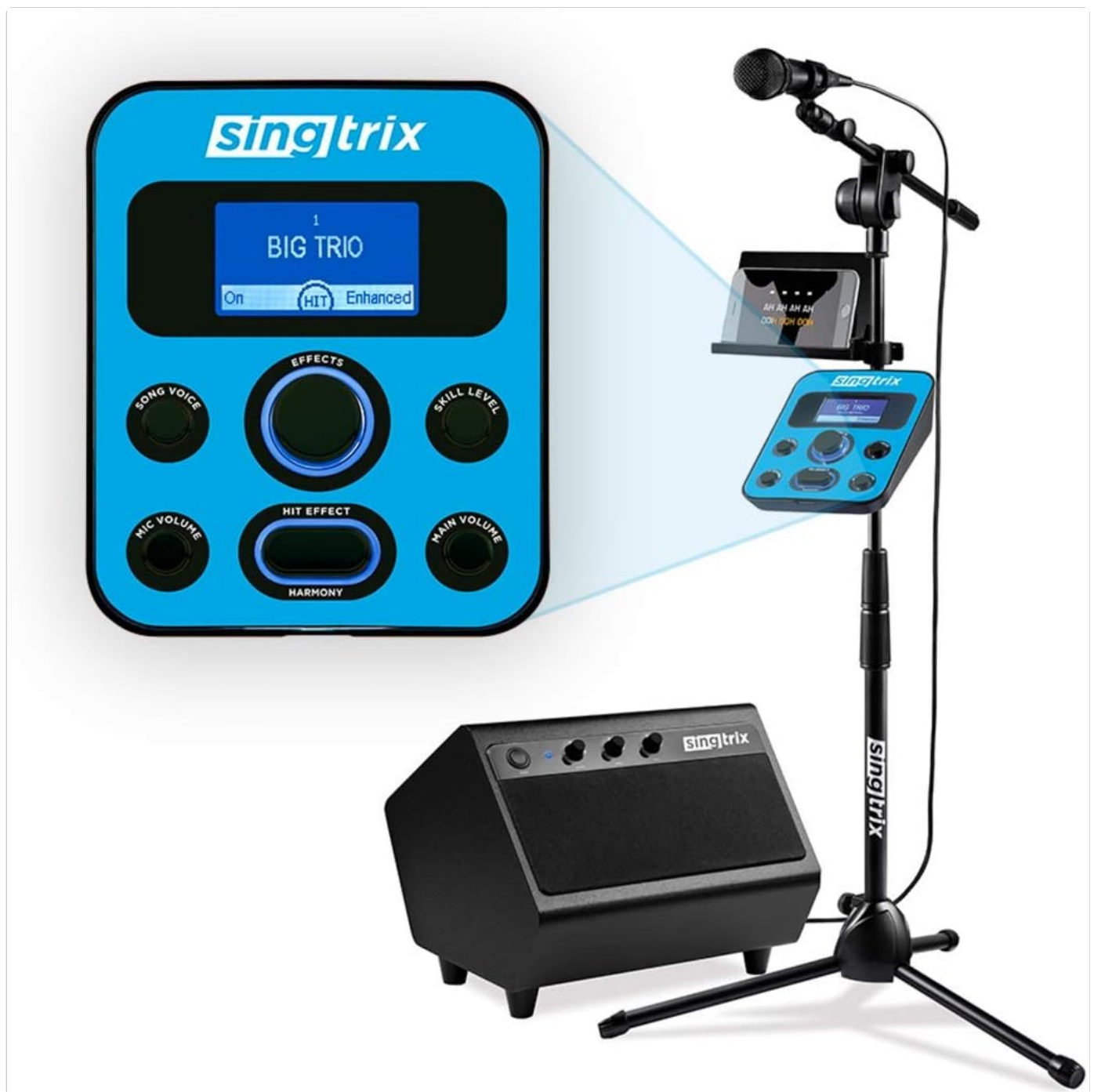
Figure 1: Singtrix Portable Karaoke Machine System Components.