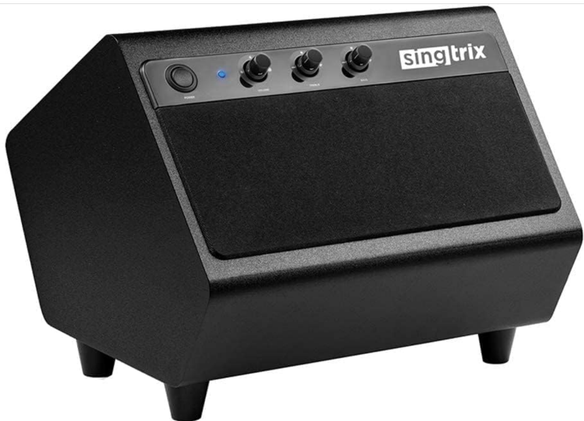
Figure 4: The 40-Watt 2.1 Stereo Speaker, featuring an integrated subwoofer for enhanced audio.