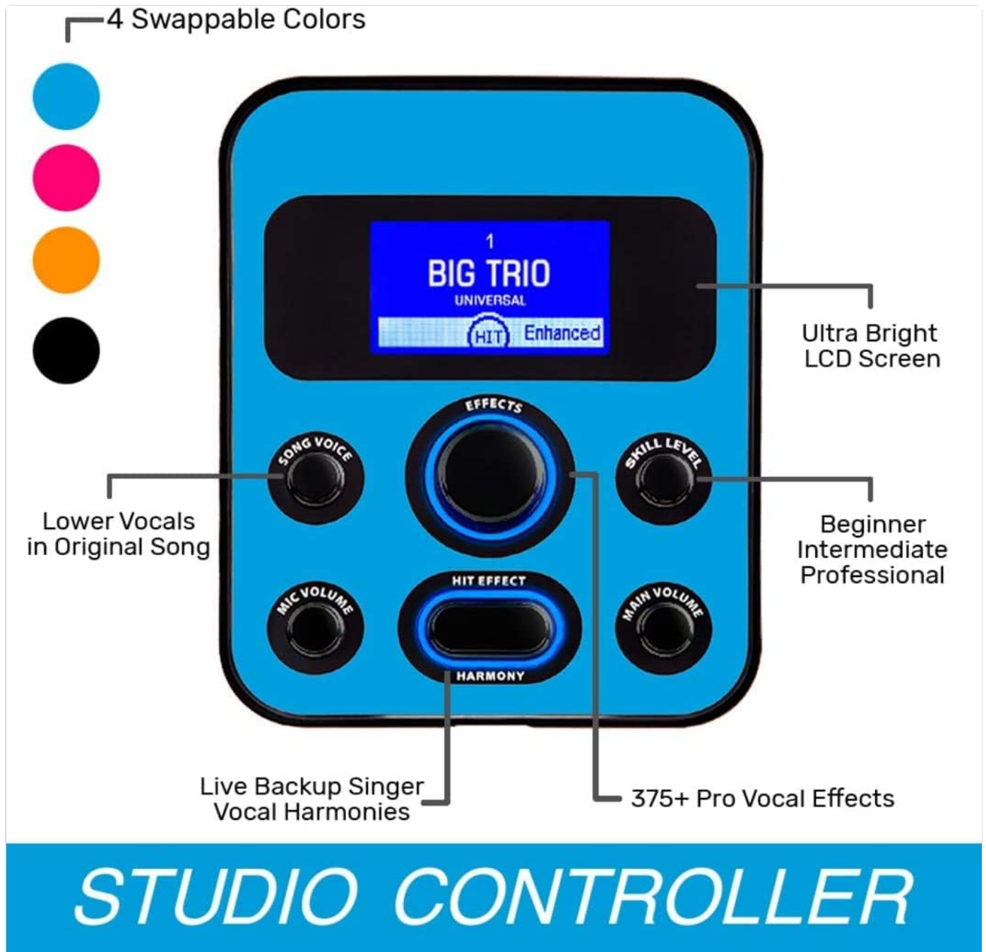
Figure 2: The Singtrix Studio Controller, featuring an LCD screen, effect, skill level, and volume controls.