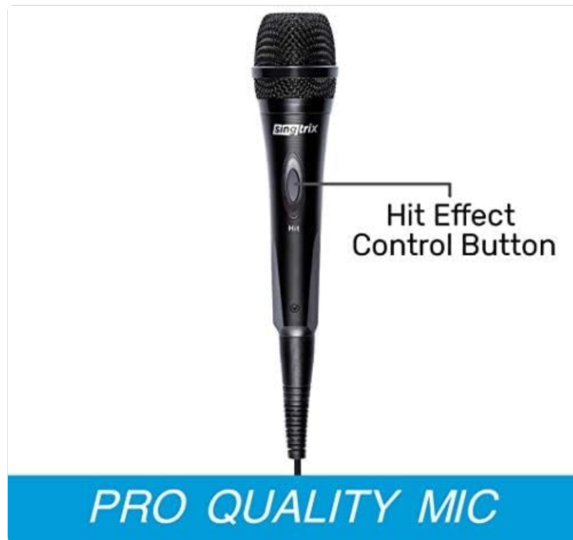
Figure 3: The Singtrix Pro Quality Microphone, equipped with a dedicated Hit Effect control button.