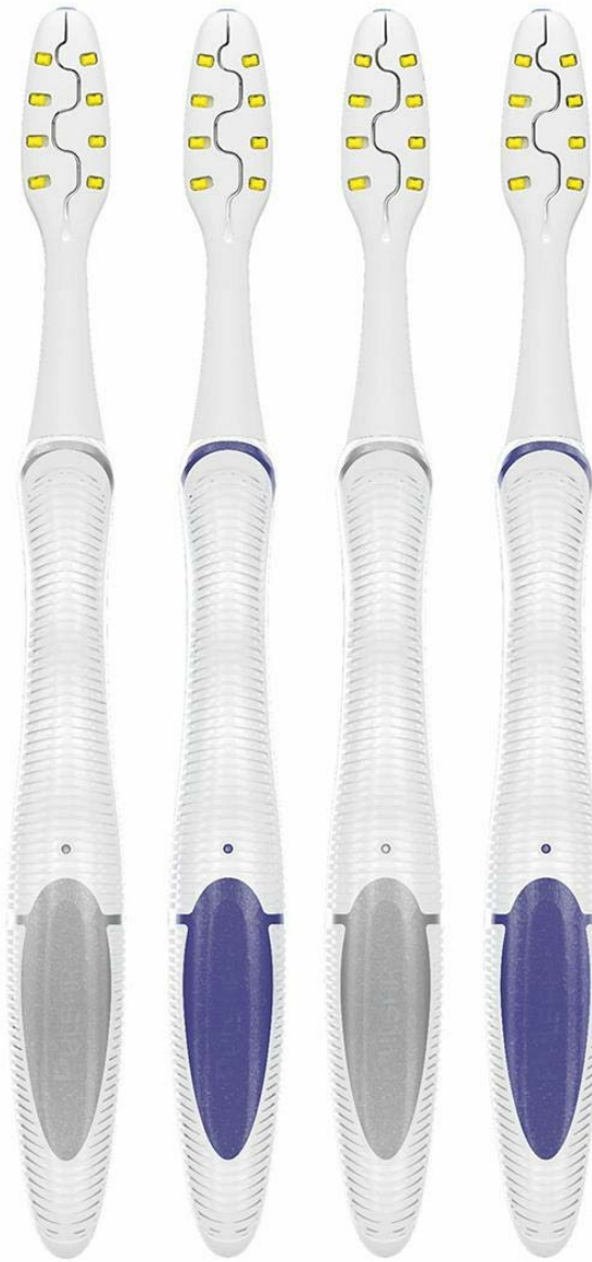
Image: Four Oral-B Pulsar 3D White Toothbrushes, showing their individual design and clear handles.