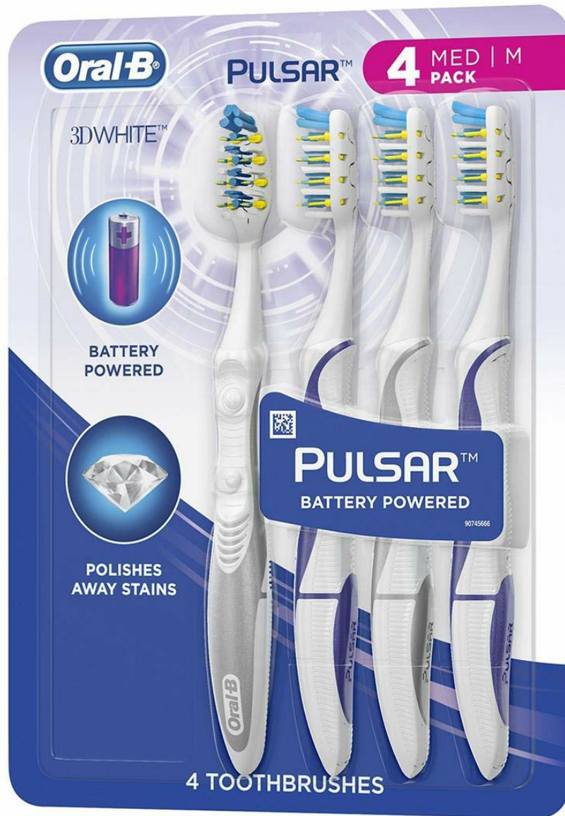
Image: Packaging for the Oral-B Pulsar 3D White Toothbrush, showing a 4-pack with battery-powered feature and stain removal claim.