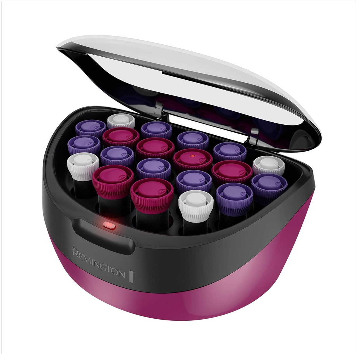
Image: The Remington H5600H Hair Setter with its lid open, displaying the 20 velvet rollers in various sizes and colors.

The Remington H5600H Ionic Conditioning Hair Setter is designed to create long-lasting curls with reduced frizz and enhanced shine. It features 20 velvet rollers with a thermal wax core for consistent heat retention and includes color-coded J-clips for secure placement.