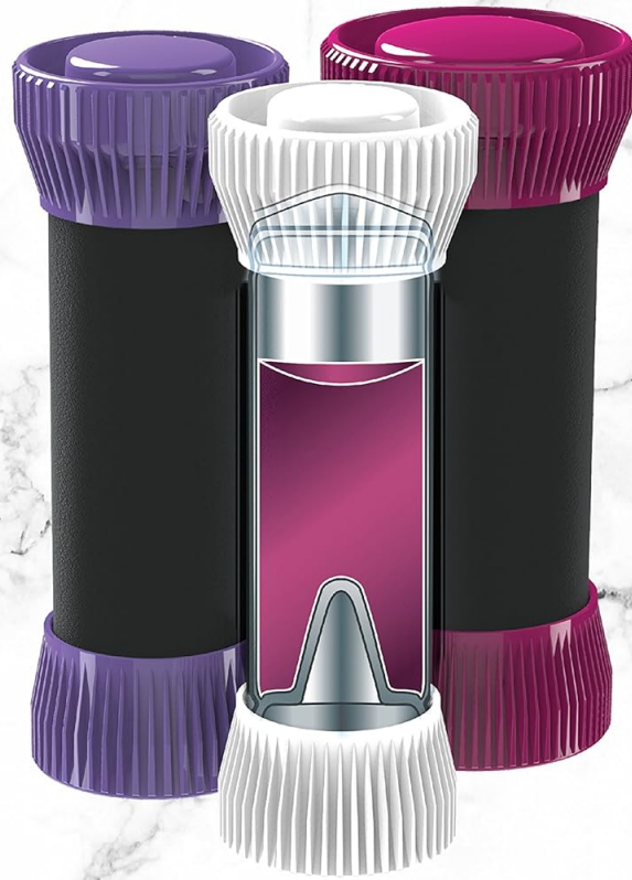
Image: A cross-section of a roller, highlighting the internal thermal wax core responsible for heat retention.

ALLOWS THE ROLLER TO RETAIN HIGH HEAT LONGER