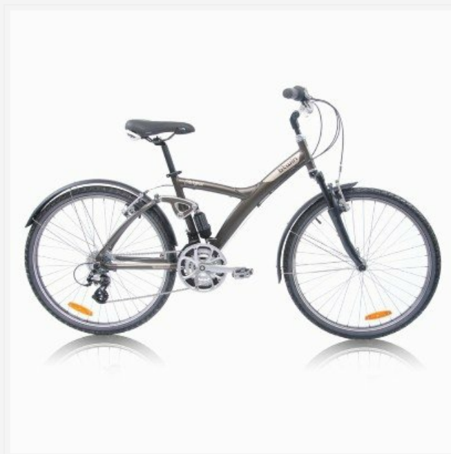
Image 1.1: The Btwin Original-7 City Bike, showcasing its overall design and grey color.