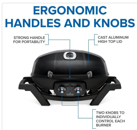
Ergonomic handles for portability and two control knobs for individual burner control.