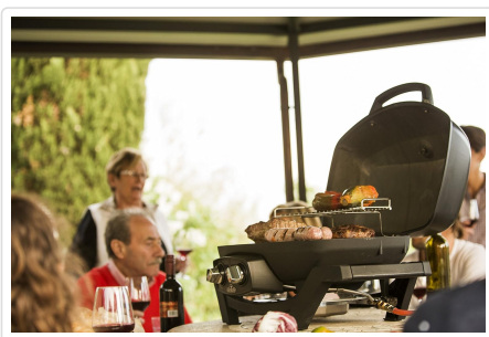
Detailed dimensions of the grill: Height 14.75 inches, Width 29 inches, Depth 18.5 inches.