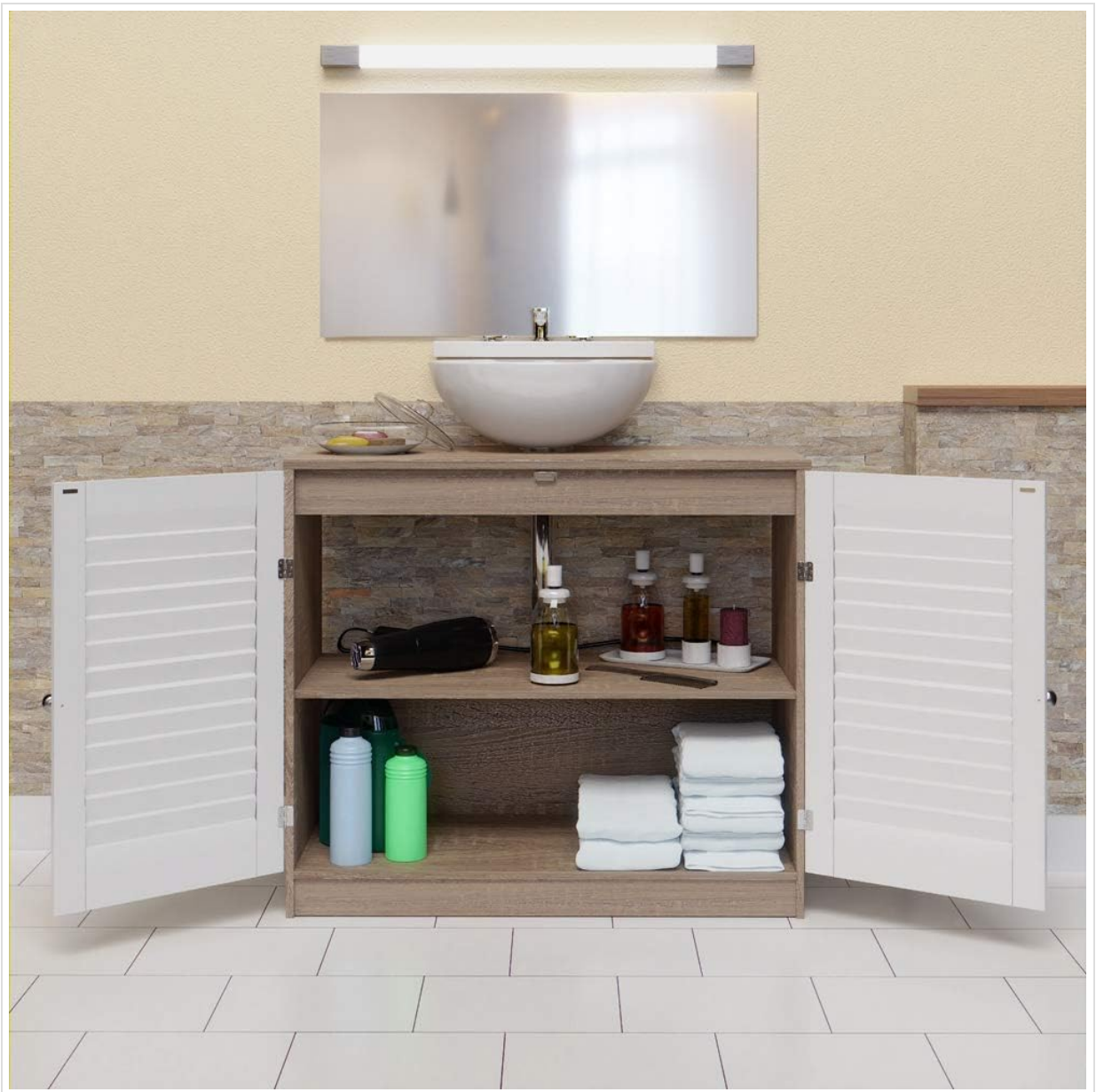
Image: The cabinet with both louvered doors open, showcasing the two internal storage compartments and the cut-out for sink plumbing.