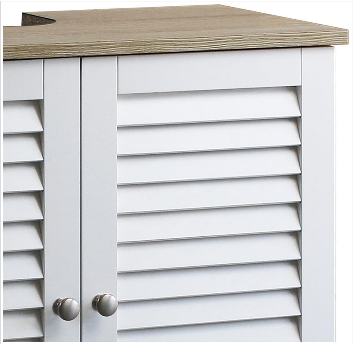
Image: A detailed view of the white louvered doors, highlighting the design and magnetic closure knobs.