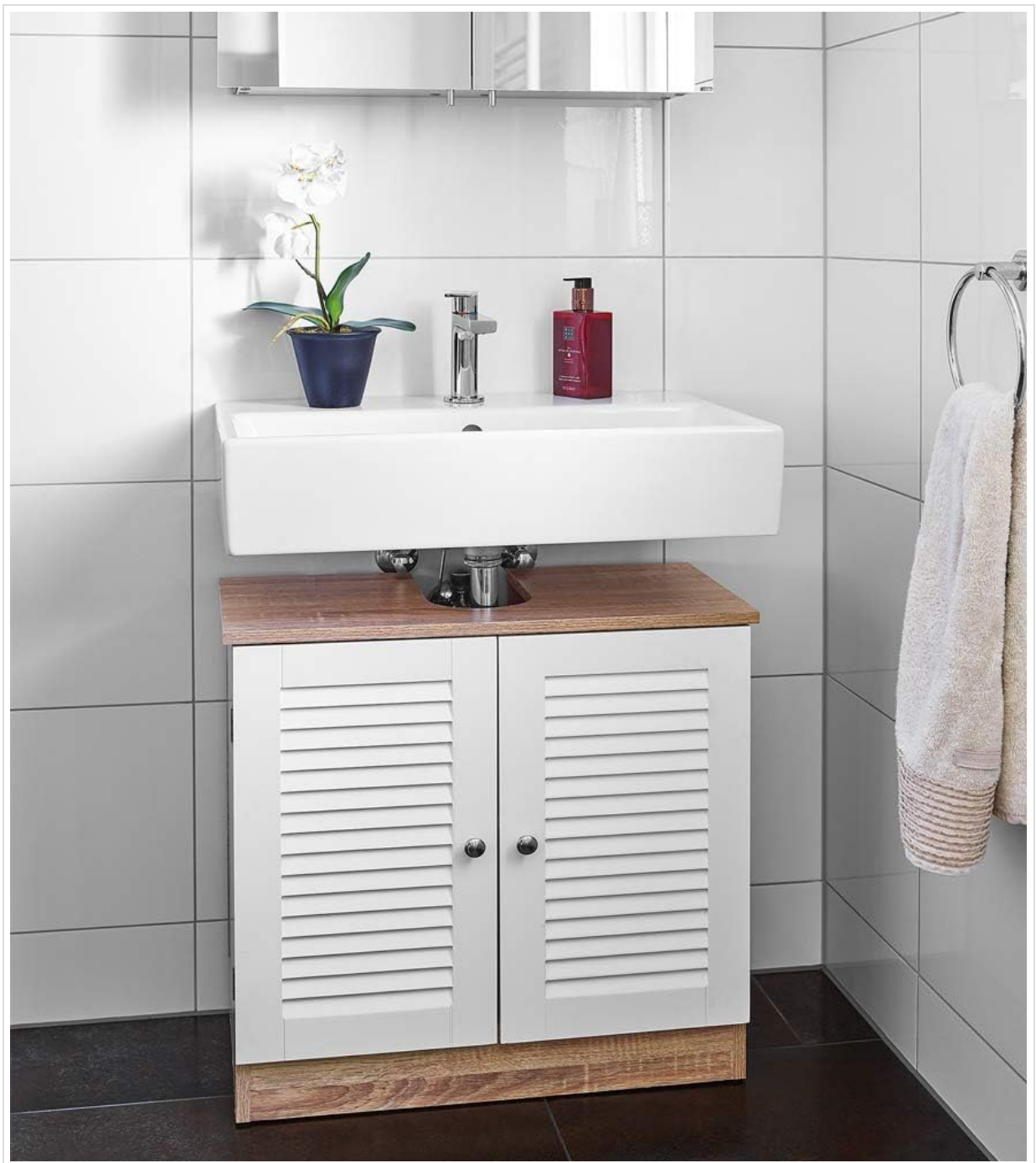
Image: The cabinet seamlessly integrated into a bathroom setting, positioned directly under a white ceramic sink, showcasing its functional and aesthetic fit.