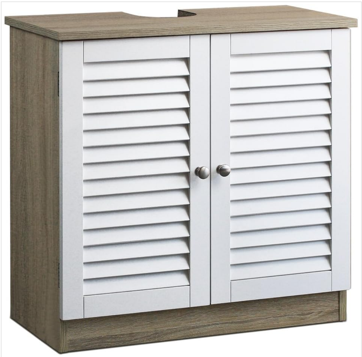
Image: The Casaria under-sink cabinet, featuring a white louvered door design and a brown wood-look top and base, designed to fit under a bathroom sink.