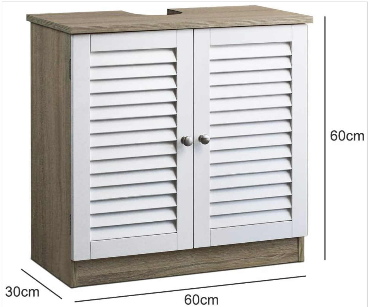
Image: A visual representation of the cabinet's dimensions, indicating a width of 60cm, depth of 30cm, and height of 60cm.