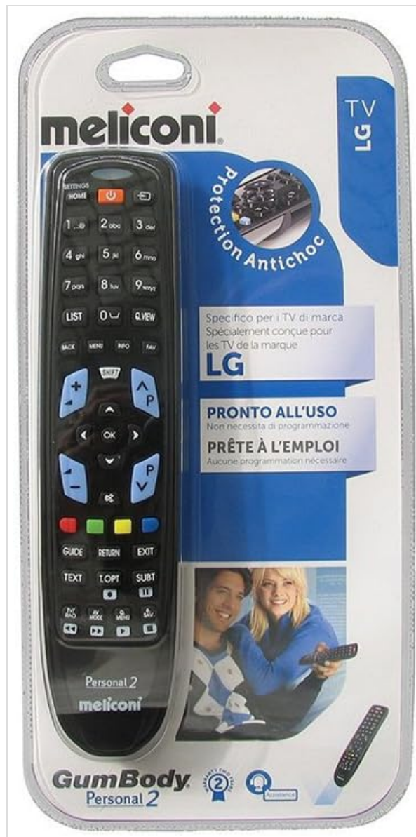
Image: The Meliconi Personal 2 Plus remote control displayed in its retail packaging, highlighting its shockproof feature and compatibility with LG TVs.