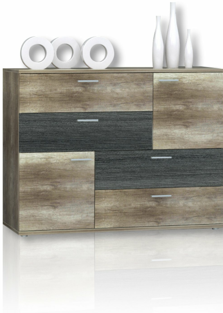
Image 1.1: The FORTE Skive Chest of Drawers, showcasing its design and finish.