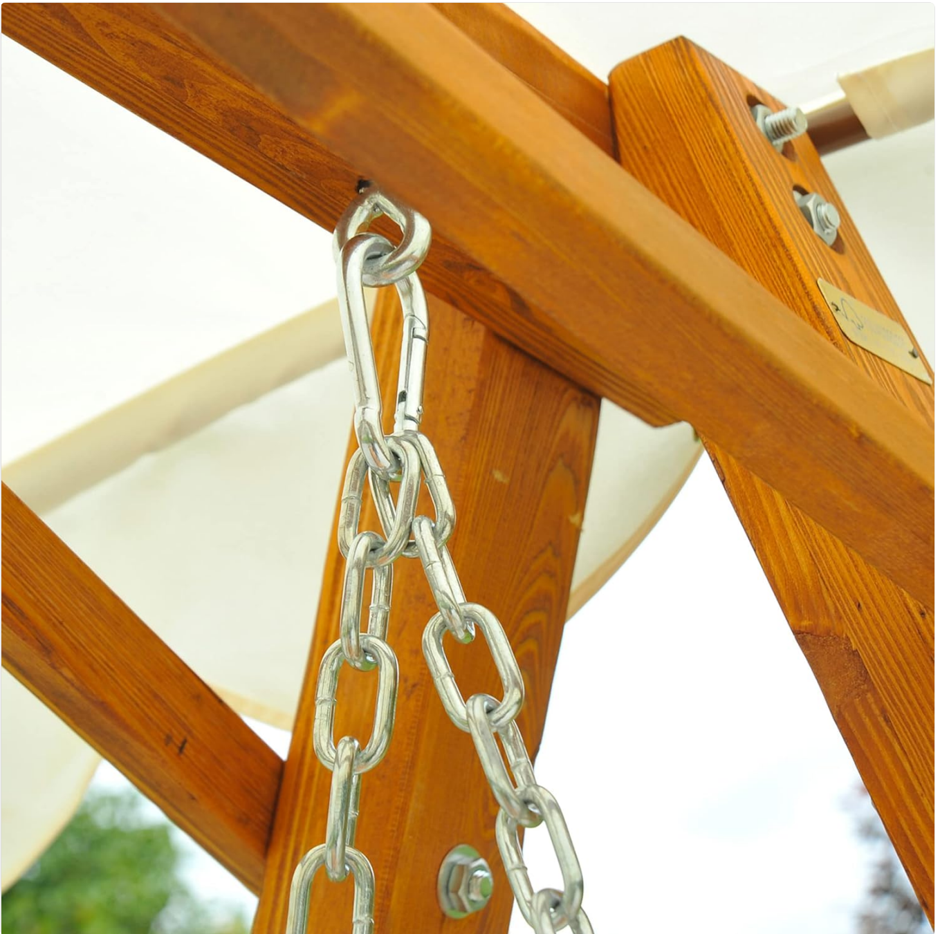
Image: A close-up view of the sturdy metal chain connecting the swing bench to the main wooden frame.