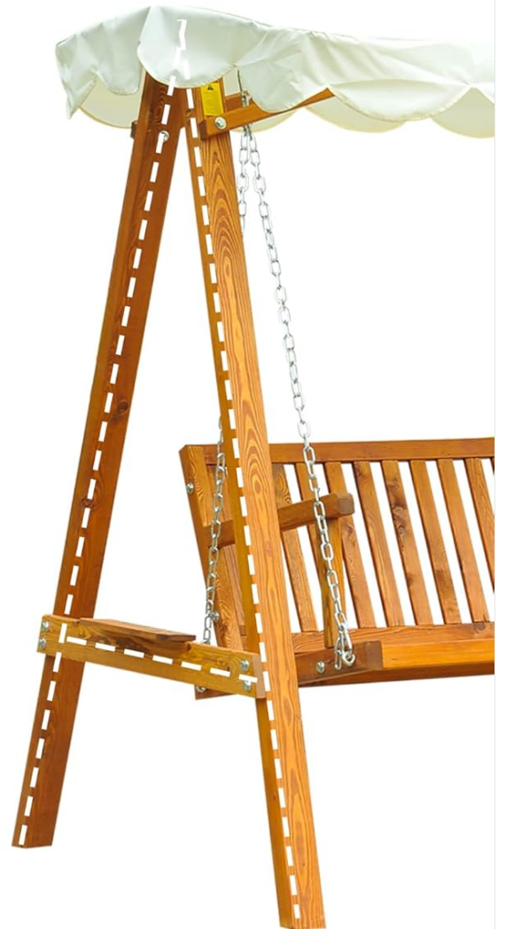
Image: Close-up view of the A-shaped frame, highlighting selected solid wood, sturdy metal chains, slatted design, and reinforced bar components.