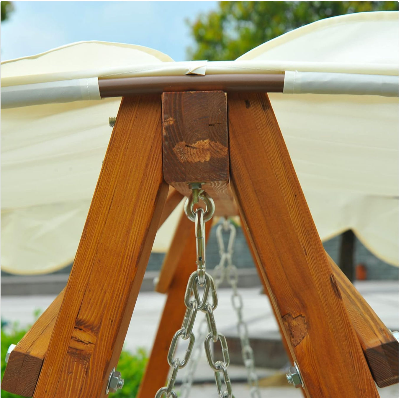
Image: Detail of the canopy attachment point, showing the fabric secured to the wooden frame.