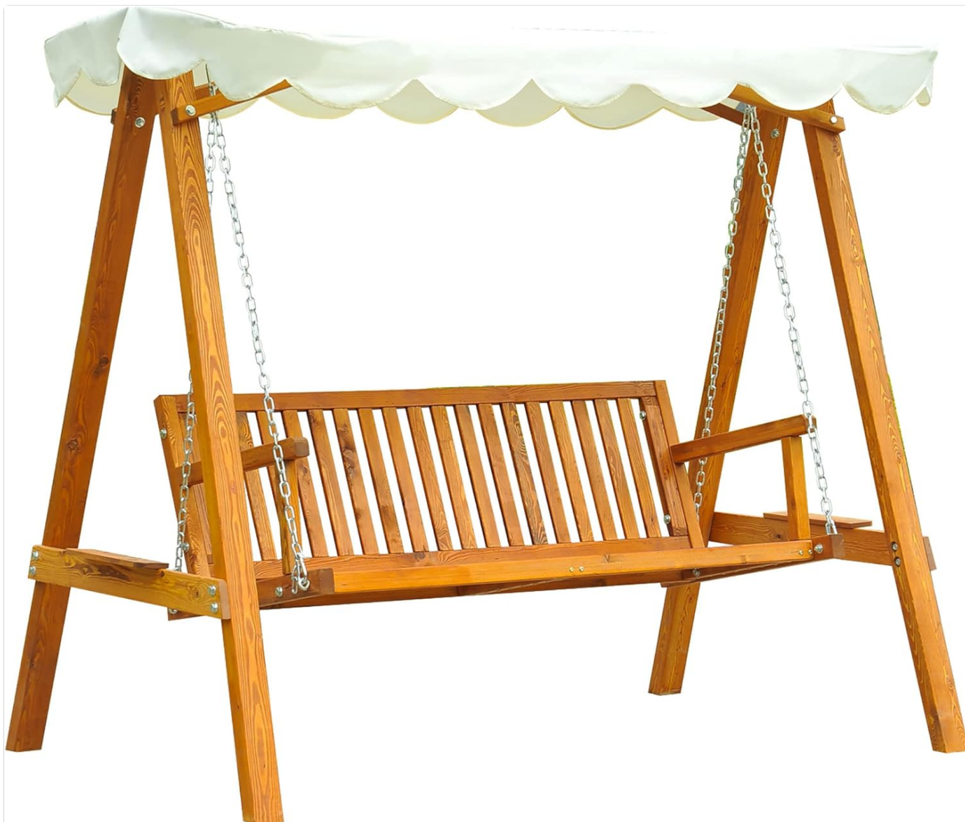
Image: The Outsunny Patio Swing Chair with its wooden frame and white canopy.