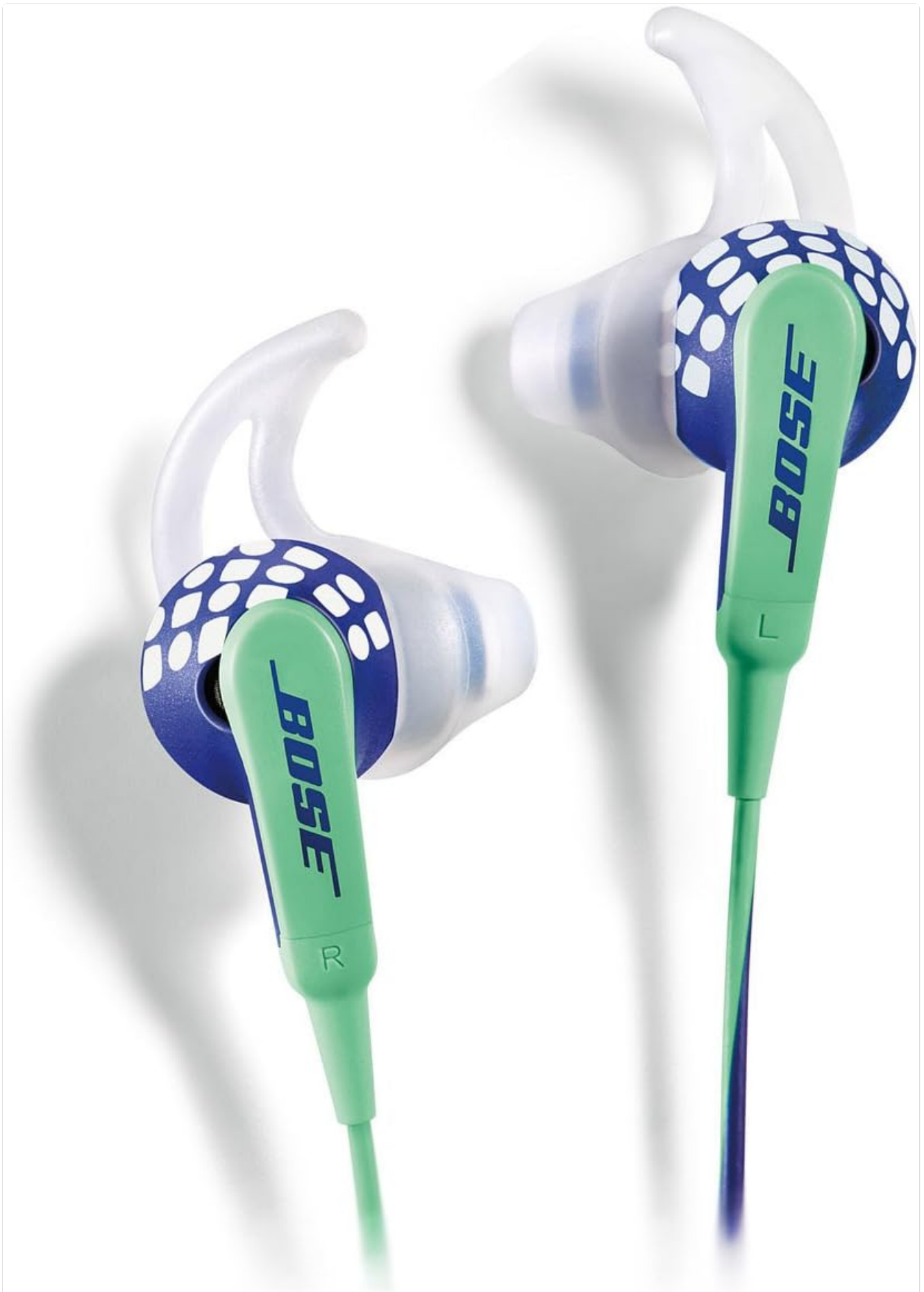
Image 3.1: A close-up view of the Bose Freestyle Earbuds, highlighting the design of the StayHear® tips and the earbud housing.