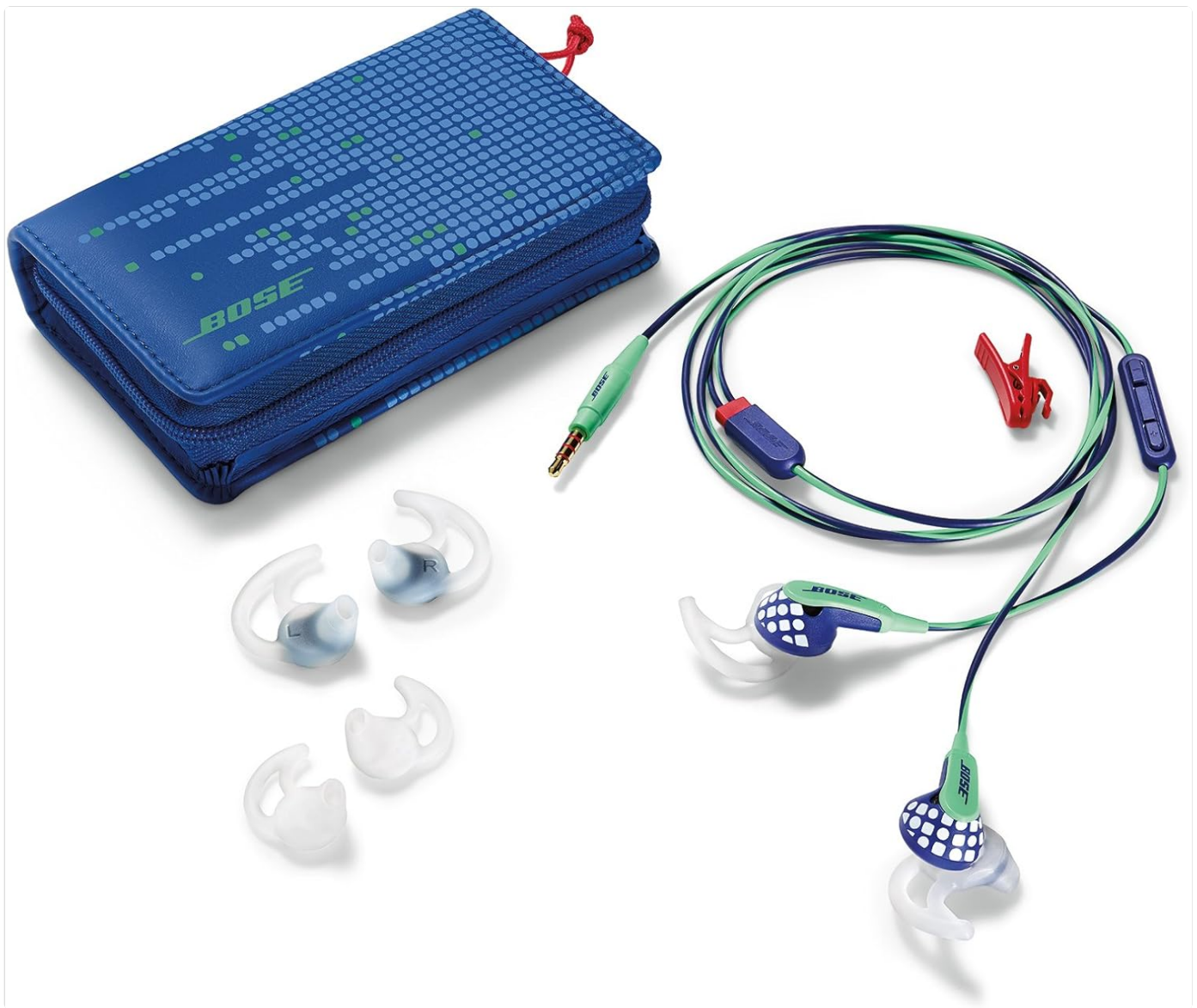
Image 1.1: Contents of the Bose Freestyle Earbuds package, including the earbuds, a blue carrying case, three sizes of StayHear® tips, and a clothing clip.