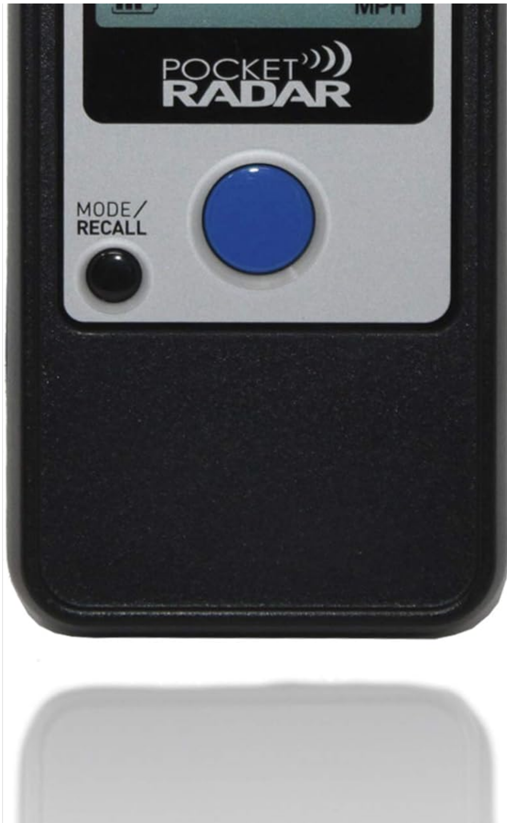
Front View: The device features a clear digital display showing speed readings in MPH, a battery indicator, and a blue measurement button. The "MODE/RECALL" button is located below the main display.