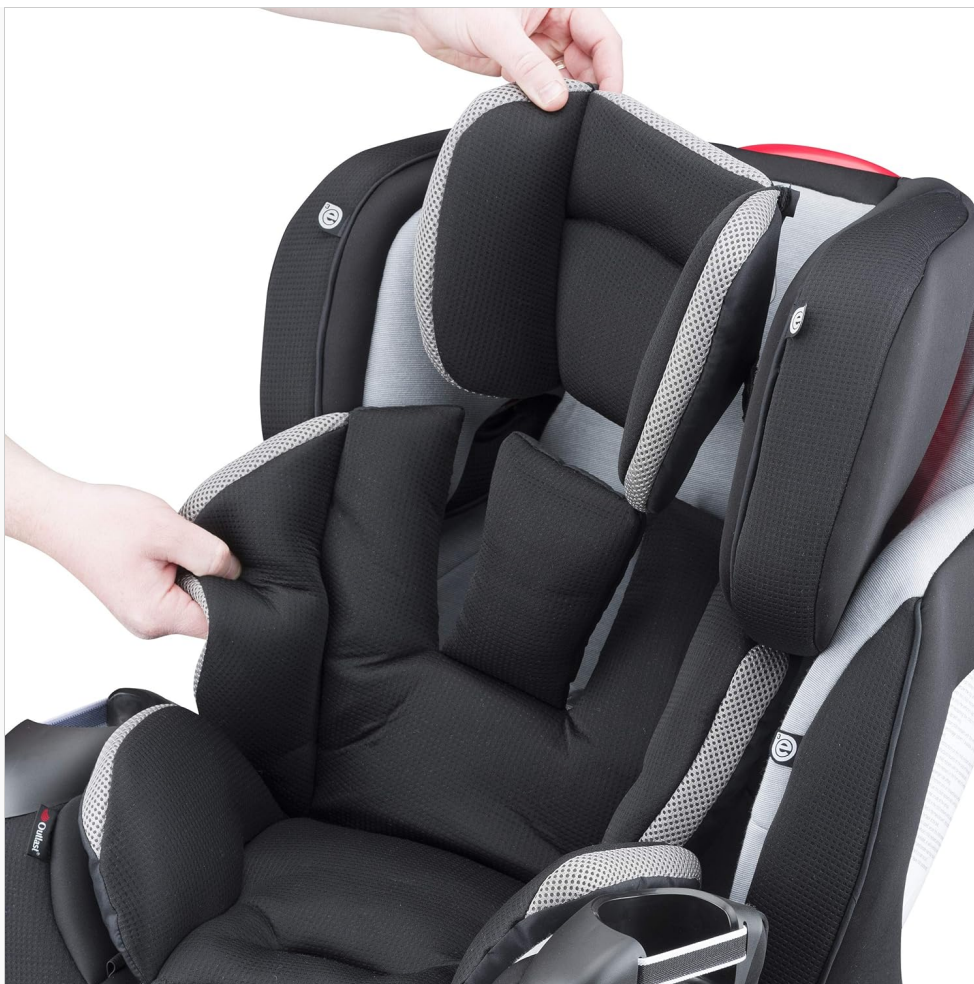
Image 6.1: A hand is shown detaching a section of the car seat's padding, demonstrating the ease of removal for cleaning.