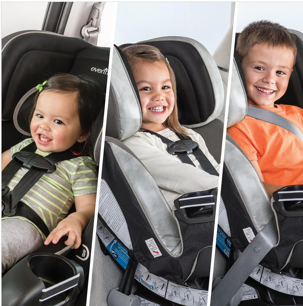
Image 4.1: This image illustrates the Evenflo Symphony DLX car seat in its three configurations: rear-facing for an infant, forward-facing for a toddler, and booster mode for an older child, demonstrating its versatility.