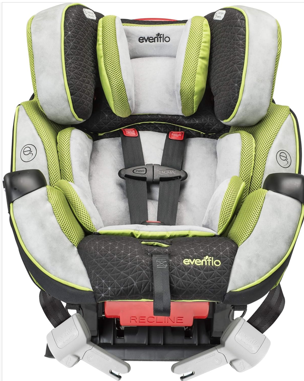
Image 1.1: Front view of the Evenflo Symphony DLX All-In-One Convertible Car Seat, showcasing its design and harness system.