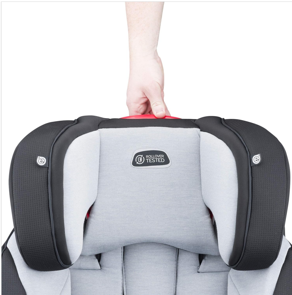
Image 5.2: A hand is shown adjusting the height of the car seat's headrest, illustrating the one-hand adjustment feature for optimal child comfort and safety.