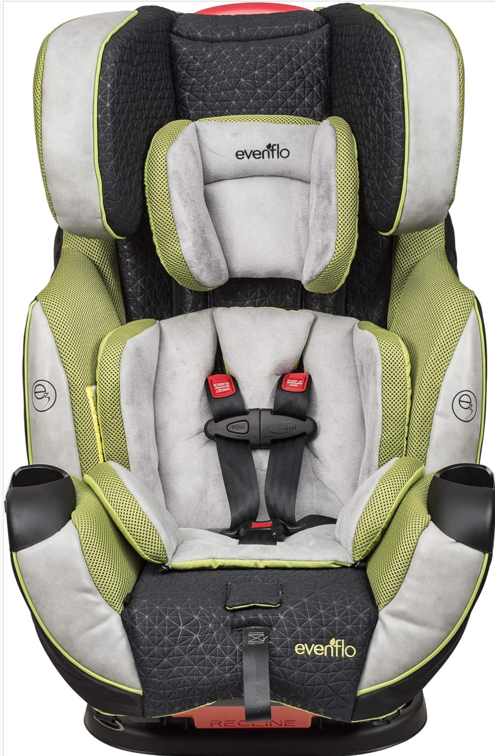
Image 3.1: Detailed front view of the car seat, highlighting the headrest, harness, and integrated cup holders.