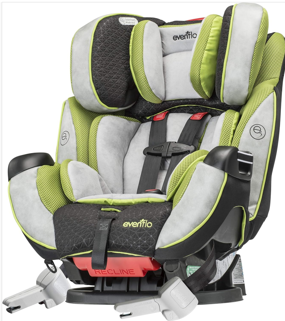
Image 5.3: Angled view of the car seat, highlighting the recline mechanism at the base, which allows for multiple comfortable positions.