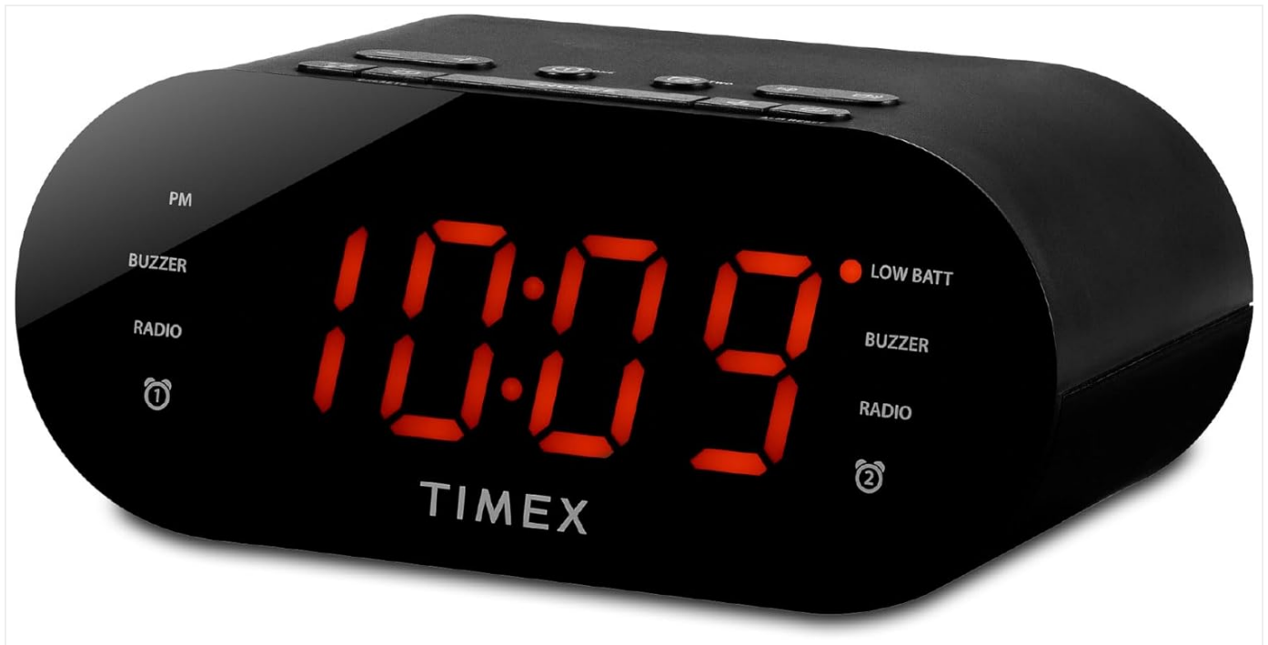
Figure 1: Front view of the Timex T231G Alarm Clock Radio, showcasing its large red LED display.

The Timex T231G is an AM/FM dual alarm clock radio designed for bedside use, offering customizable sleep and wake-up settings. It features a large 1.2-inch LED display for clear visibility and includes an auxiliary input for connecting external audio devices. This clock radio is equipped with a battery backup system to maintain time and alarm settings during power interruptions.