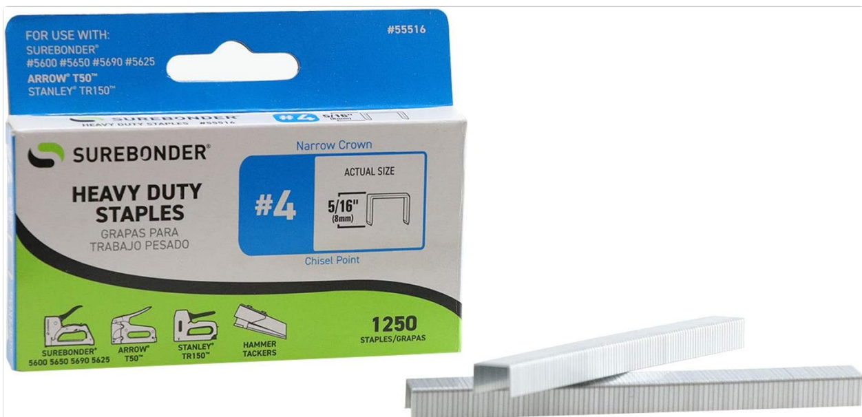
Image: Surebonder 55516 Heavy Duty Staples packaging, showing the box and a strip of staples. The box highlights "Heavy Duty Staples" and "5/16" (8mm)" leg length with a narrow crown design.

These staples are specifically designed to be compatible with Surebonder 5690 Triggerfire, 5600 HD 3-in-1 Stapler, 5685 HD Professional/Contractor Gun, 5800 HD Hammer Tacker, and Surebonder 9600A Pneumatic Narrow Crown Stapler. They also fit many other popular models including Arrow T50, Stanley TR110, TR150HL, Powerfast (Swingline) 10401, 31690, 31890, Ace Hardware 2014413, Craftsman 68517, 68492, 68515, and Black & Decker 5700.