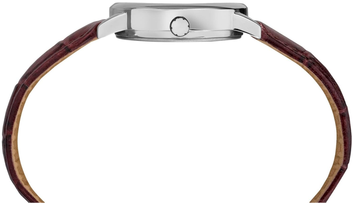
Image: Side profile of the watch, highlighting the crown used for time adjustment.