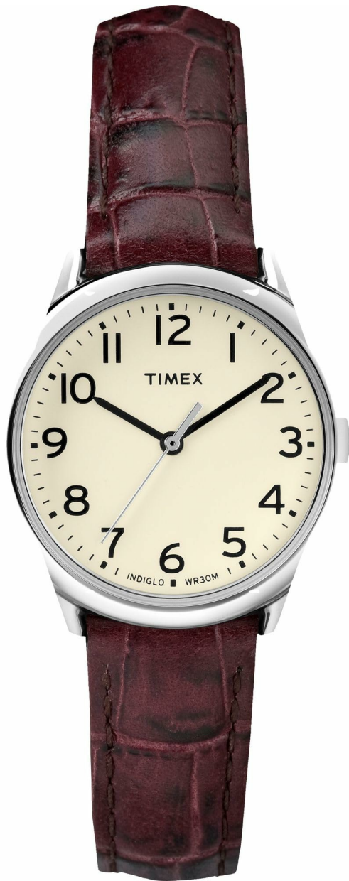
Image: Front view of the Timex Women's Easy Reader Watch, showcasing the white dial with large, clear numbers and a brown leather strap.