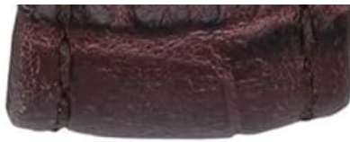
Image: A close-up view of the watch's brown leather strap and silver buckle.