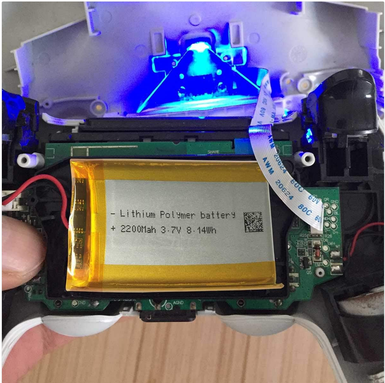
Image: The 2200mAh LIP1522 replacement battery correctly installed within the open casing of a PS4 controller, showing the battery seated in its compartment and connected to the circuit board.