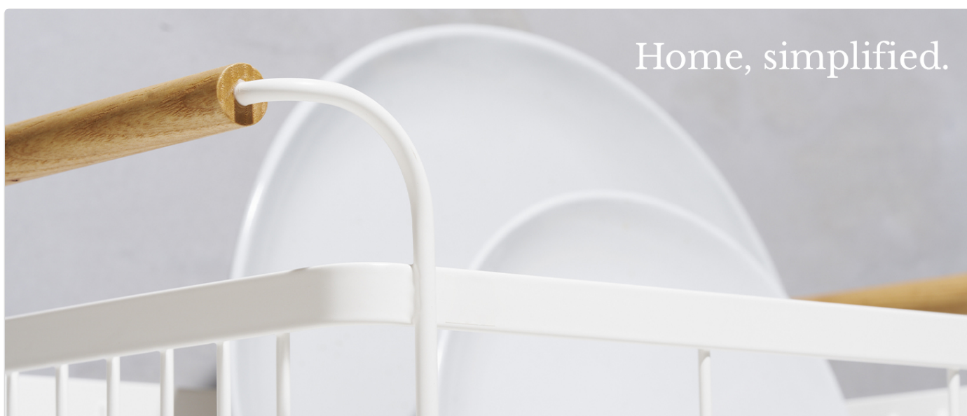
Image 3.1: The drying rack displayed, highlighting its structure and design.