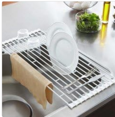
Image 1.1: The drying rack extended over a sink, supporting dishes and utensils.

The Yamazaki Home Tower 7835 Over-The-Sink Folding Drying Rack is a versatile kitchen accessory designed to optimize space and assist with dish drying and food preparation. Constructed from durable carbon steel, this rack features a foldable design for easy storage when not in use. Its primary function is to provide a stable surface over your sink for air-drying dishes, fruits, or vegetables, and can also serve as an extended countertop for various kitchen tasks.