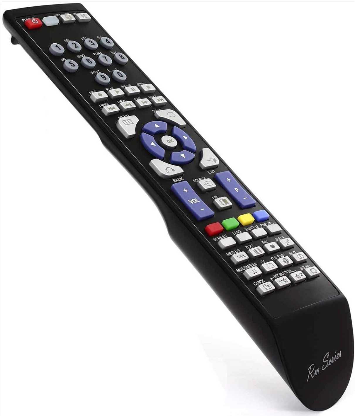
Figure 1: Front view of the RM Series RMC10664 remote control, displaying its ergonomic design and clearly labeled buttons for various functions including power, numbers, volume, channel, navigation, and dedicated app buttons.