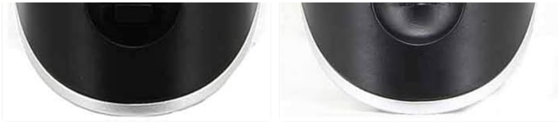
Figure 2: Back view of the remote control with the battery compartment closed (left) and open (right), illustrating the battery installation process for two AAA batteries.