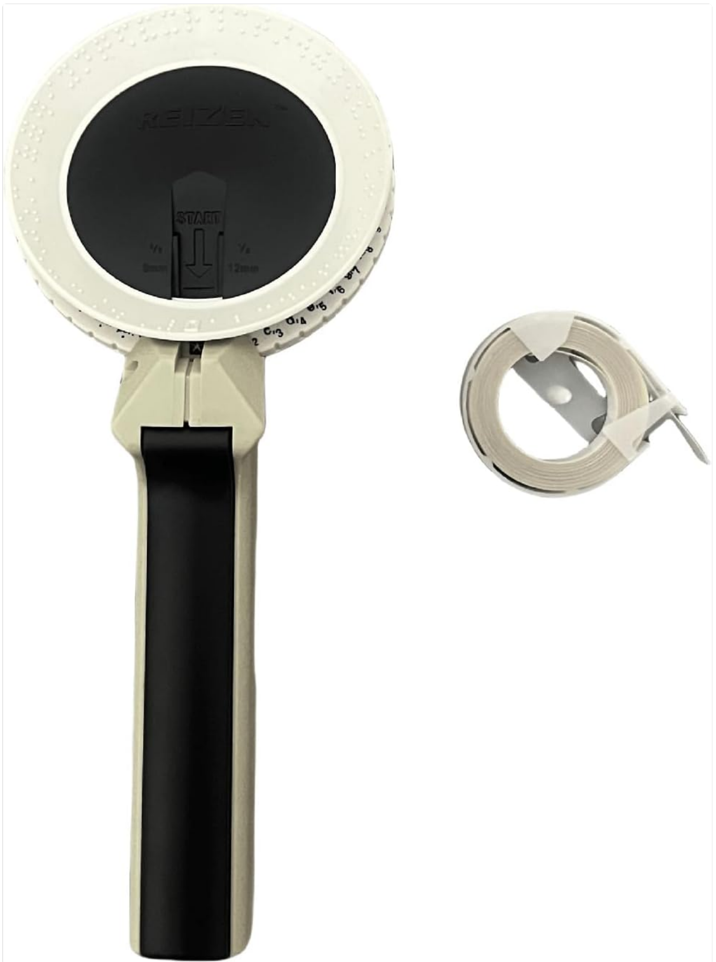
Figure 1: The Reizen RL-350 Braille Labeler shown alongside a roll of compatible labeling tape.