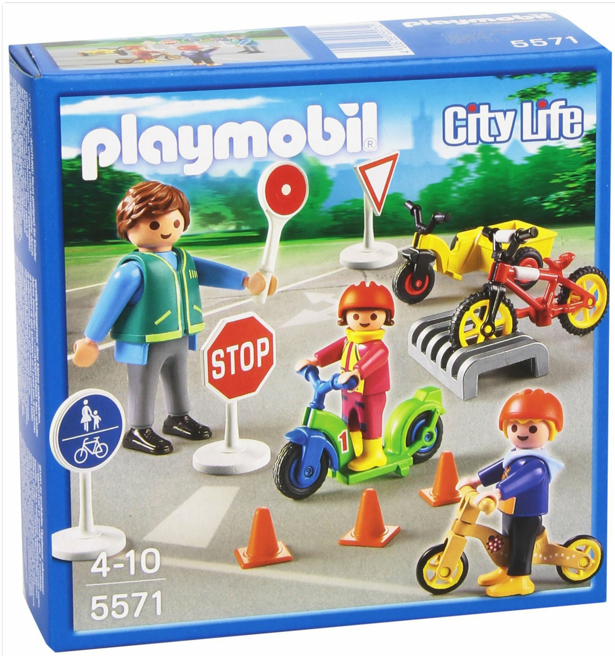
Image 1: The Playmobil 5571 Road Safety Training Set, showcasing the included figures, bicycles, scooter, and various traffic signs and cones.