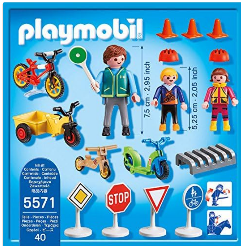
Image 2: Overview of the Playmobil 5571 set contents, including the 40 pieces and their approximate dimensions.