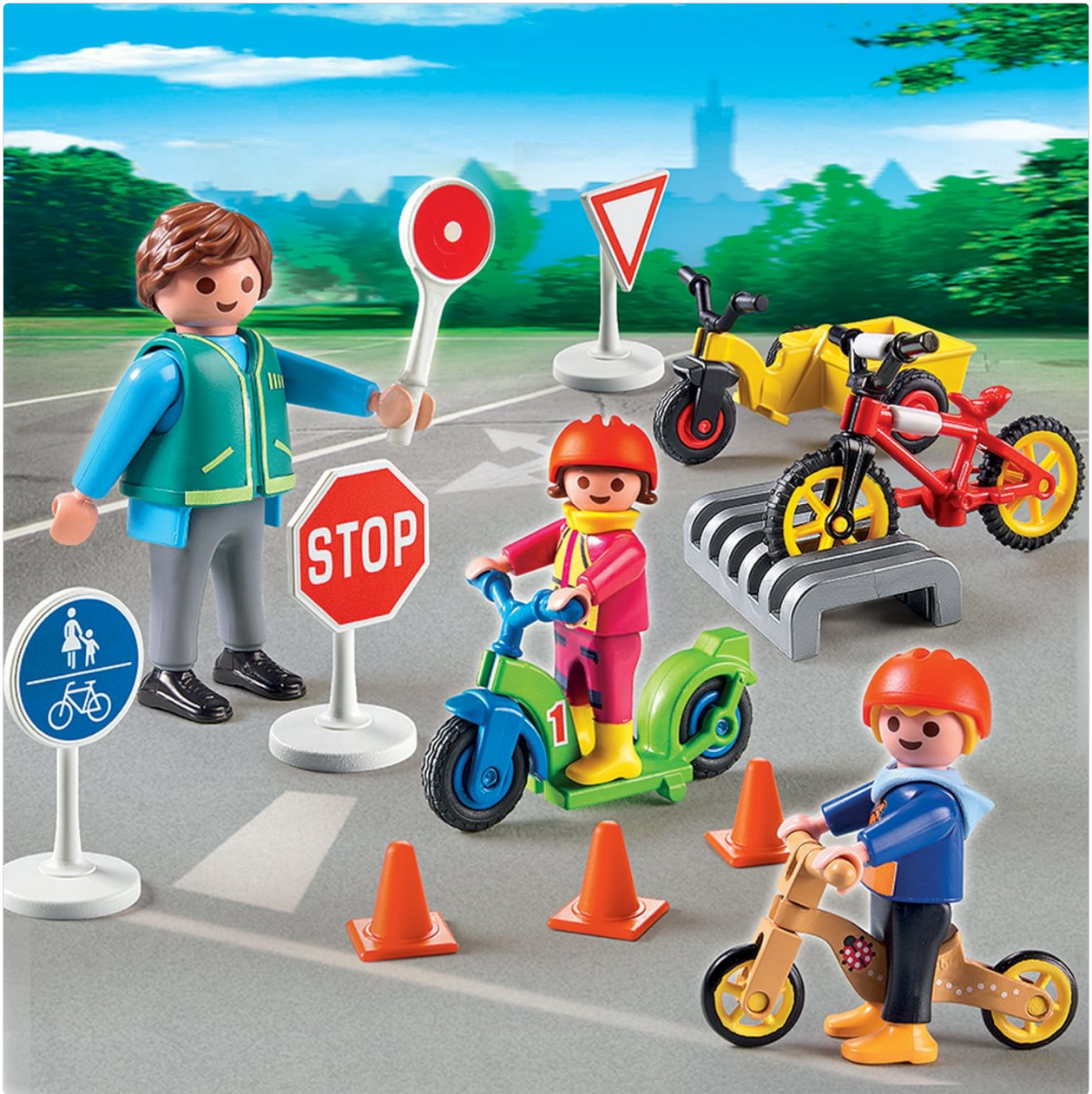
Image 3: Playmobil figures interacting with the road safety elements, showing a child on a scooter at a stop sign and another on a balance bike.