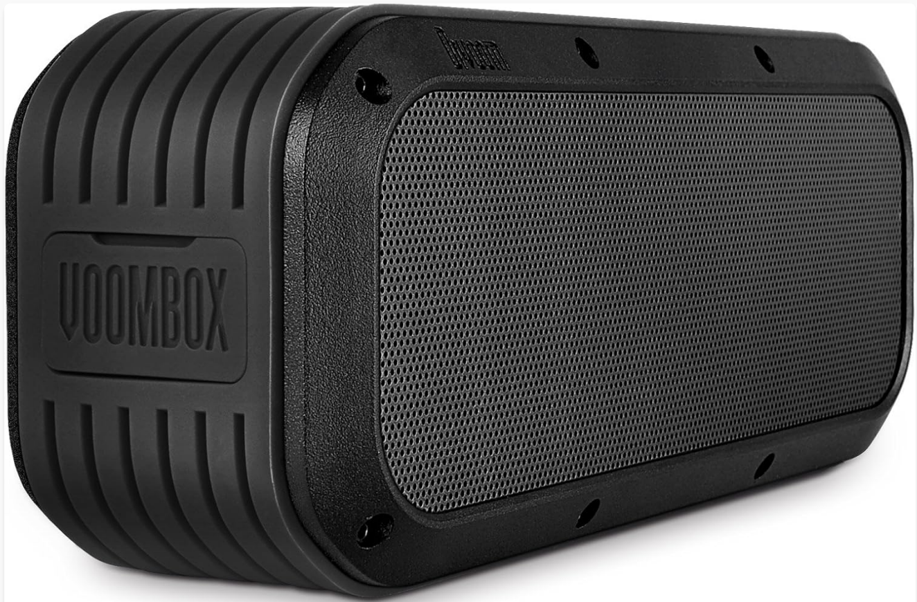
Figure 1: Divoom Voombox Outdoor Speaker, showcasing its robust design.