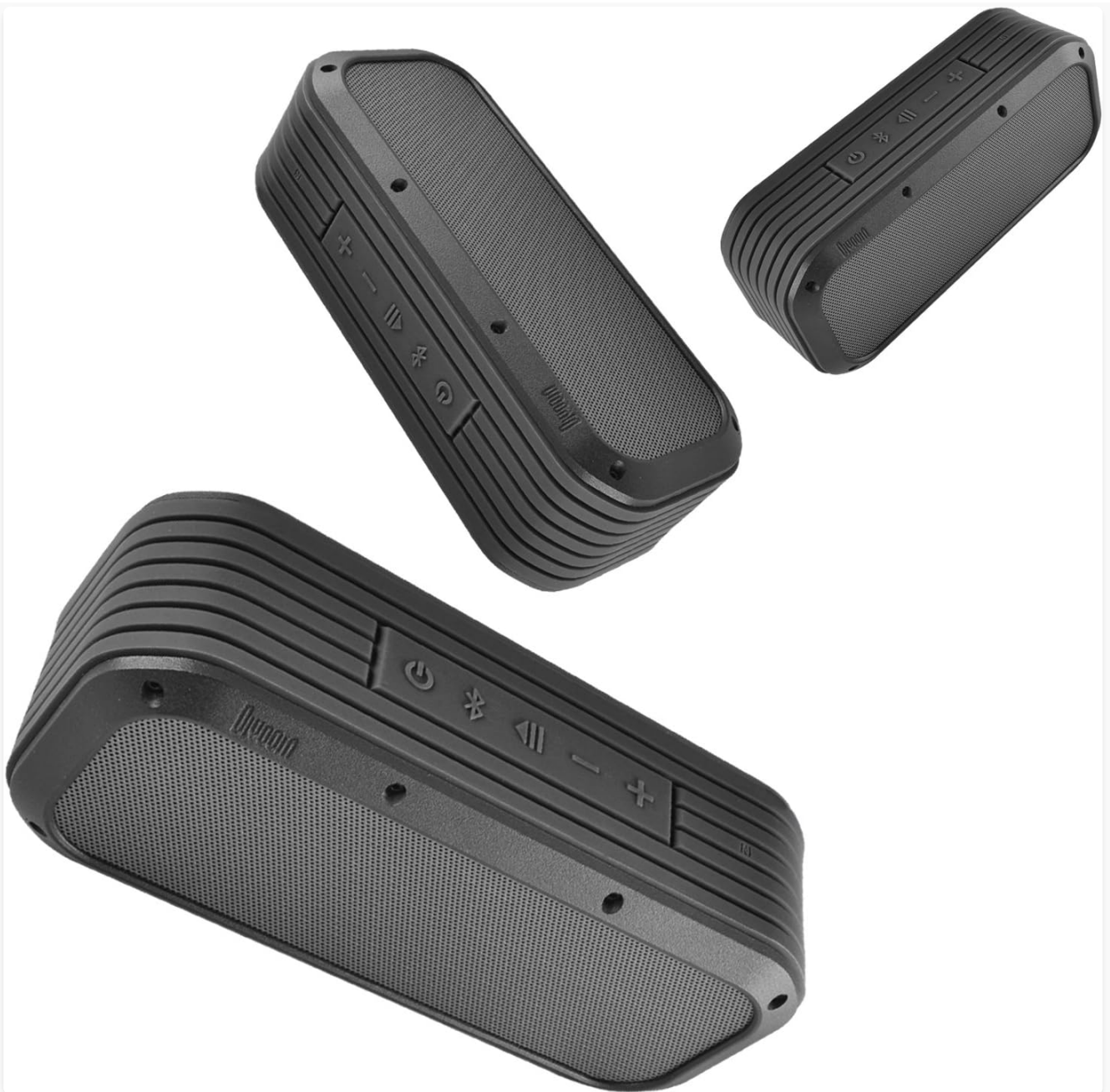
Figure 2: Top view of the Voombox Outdoor Speaker, highlighting its control panel.