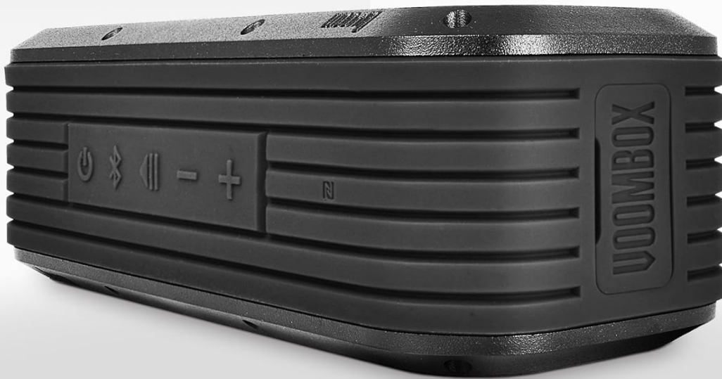
Figure 4: Visual representation of the Voombox Outdoor Speaker's 12-hour battery life.