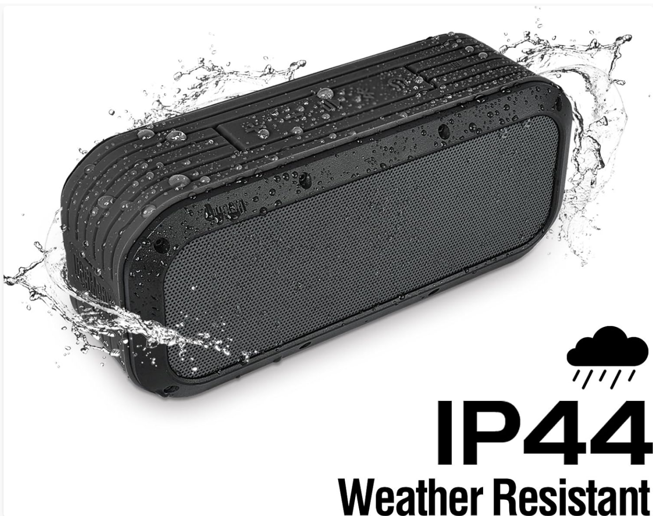
Figure 3: The Voombox Outdoor Speaker demonstrating its IP44 weather resistance against splashes.