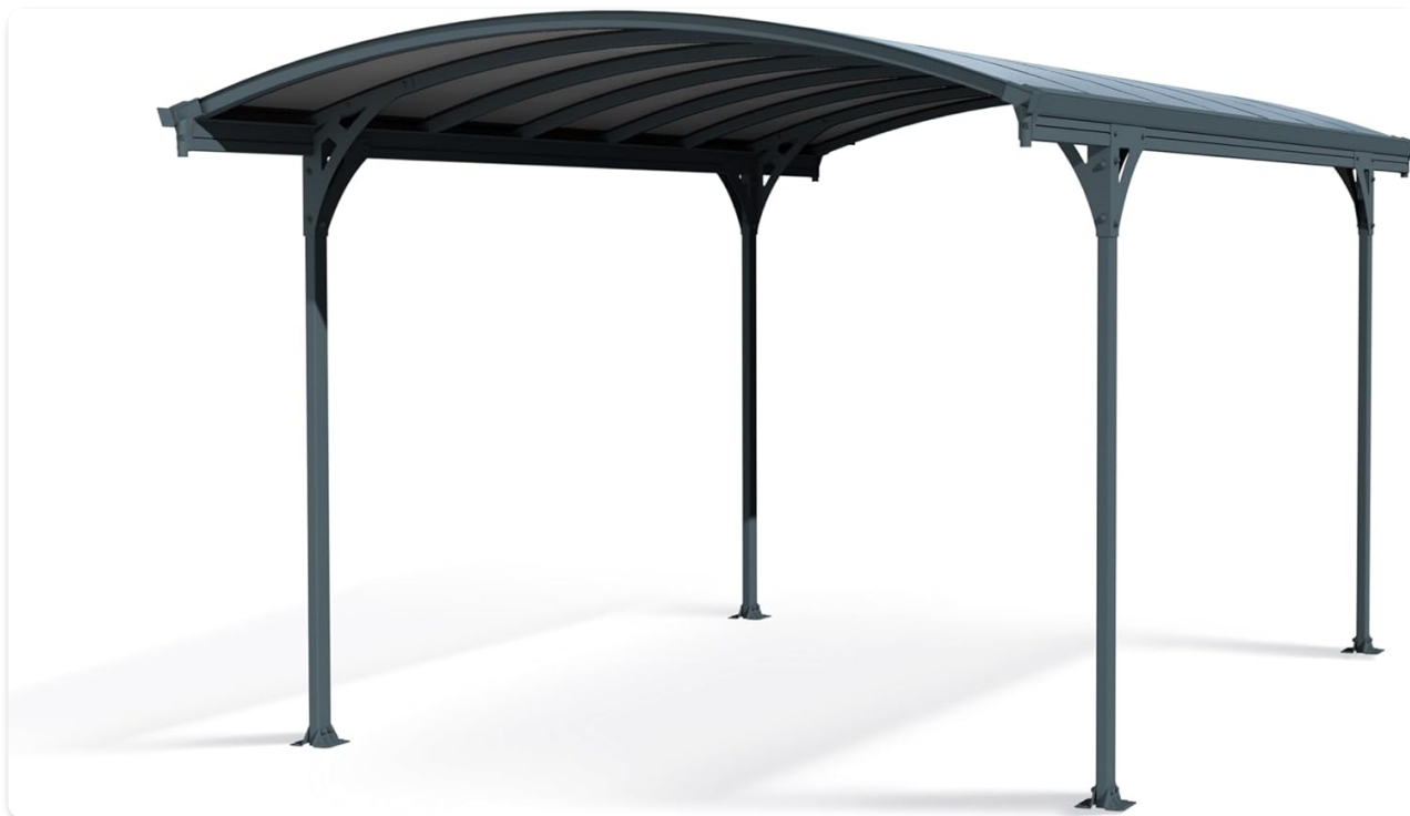
Image 1.1: The Palram - Canopia Vitoria 5000 Carport, showcasing its elegant design.

The Vitoria 5000 carport offers an upscale design, providing versatile shelter for vehicles or creating a comfortable outdoor sitting area. Its generous dimensions accommodate various vehicles, and the structure can be relocated and re-assembled if needed. This carport is designed for durability, requiring minimal maintenance and resisting corrosion over time.