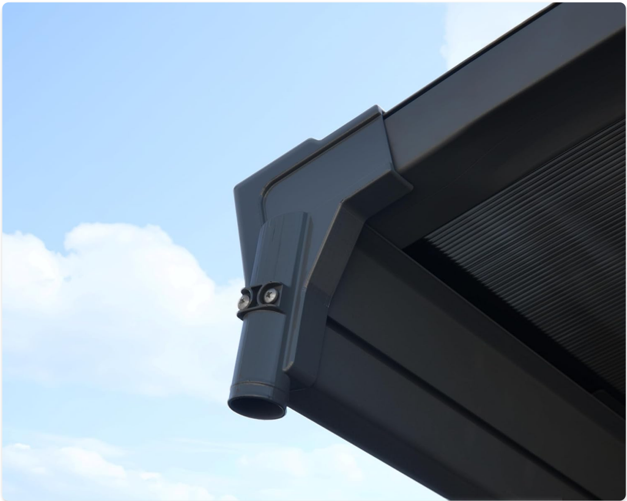
Image 4.1: Detail of the integrated gutter system, designed for effective water drainage.