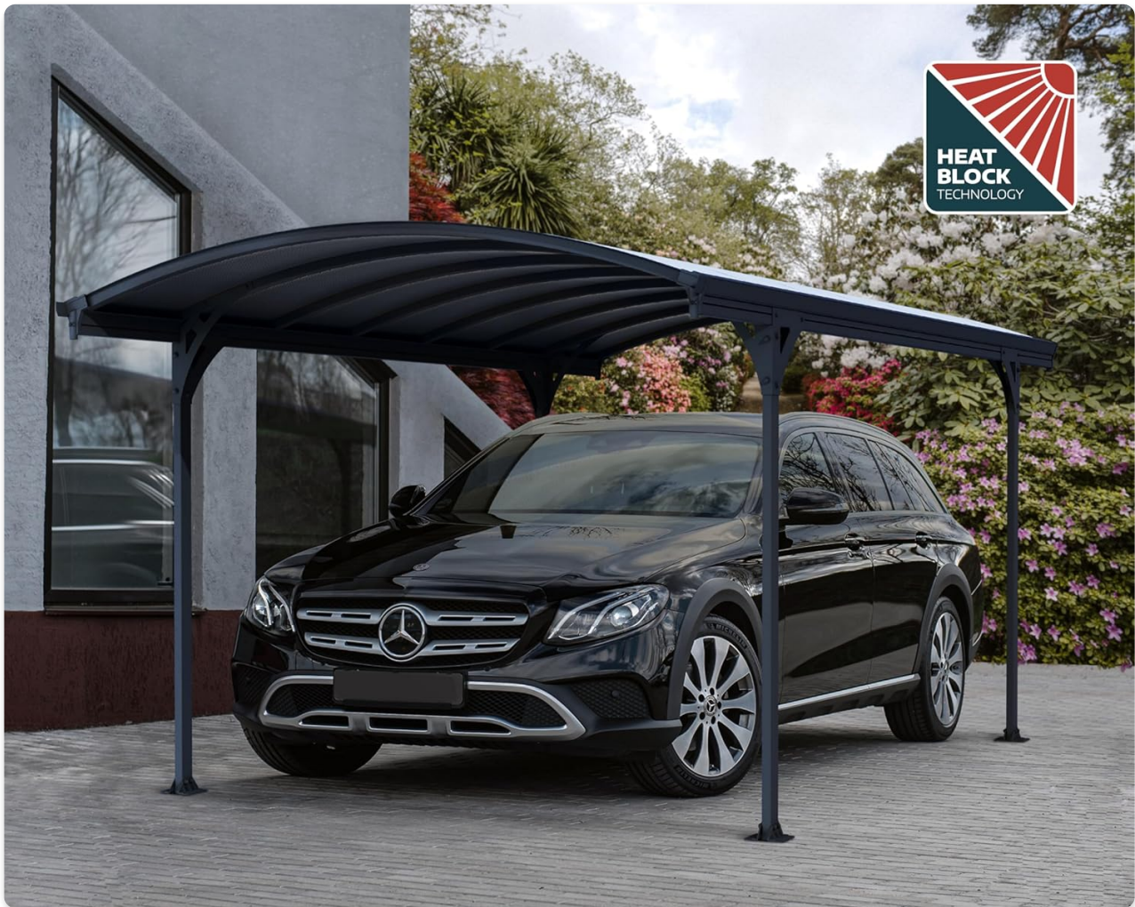
Image 1.2: A vehicle parked under the Vitoria 5000 Carport, highlighting its protective capabilities and Heat Block Technology.