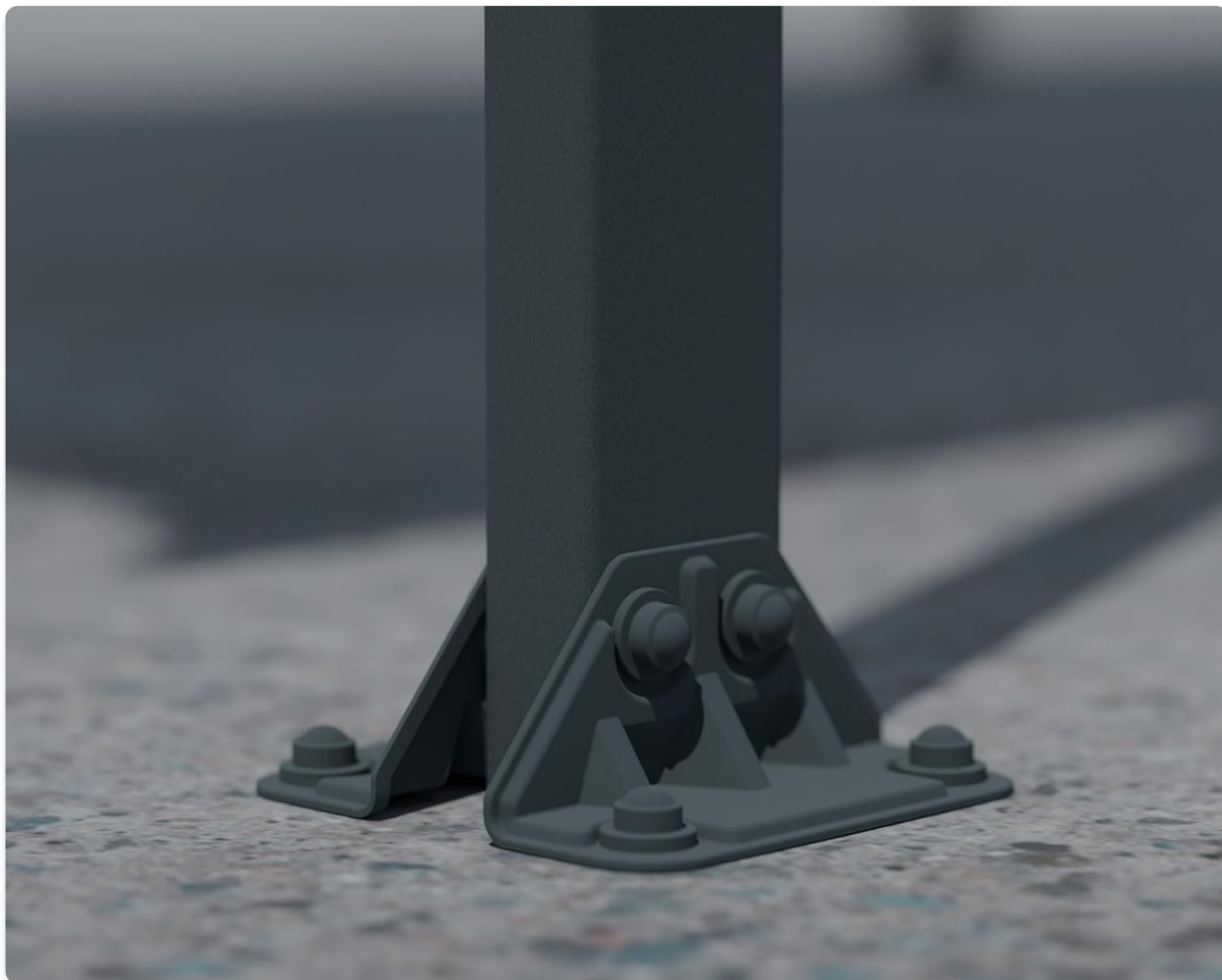
Image 3.1: Detail of the anchoring system, showing how the carport is secured to the ground.

Important: Always ensure the carport is securely anchored to the ground as per the installation manual to prevent movement during high winds or heavy snow loads.