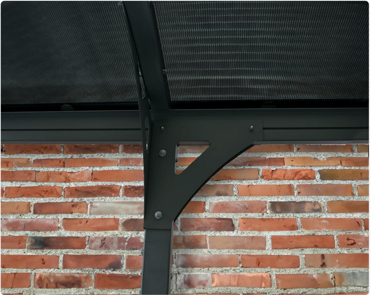
Image 3.2: View of the robust aluminum frame and galvanized steel connectors, ensuring structural integrity.