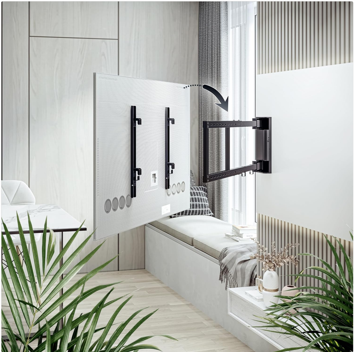
Image 2: Illustration of attaching the TV to the wall mount, showing the TV brackets connected to the television and then hooked onto the main mount arm.