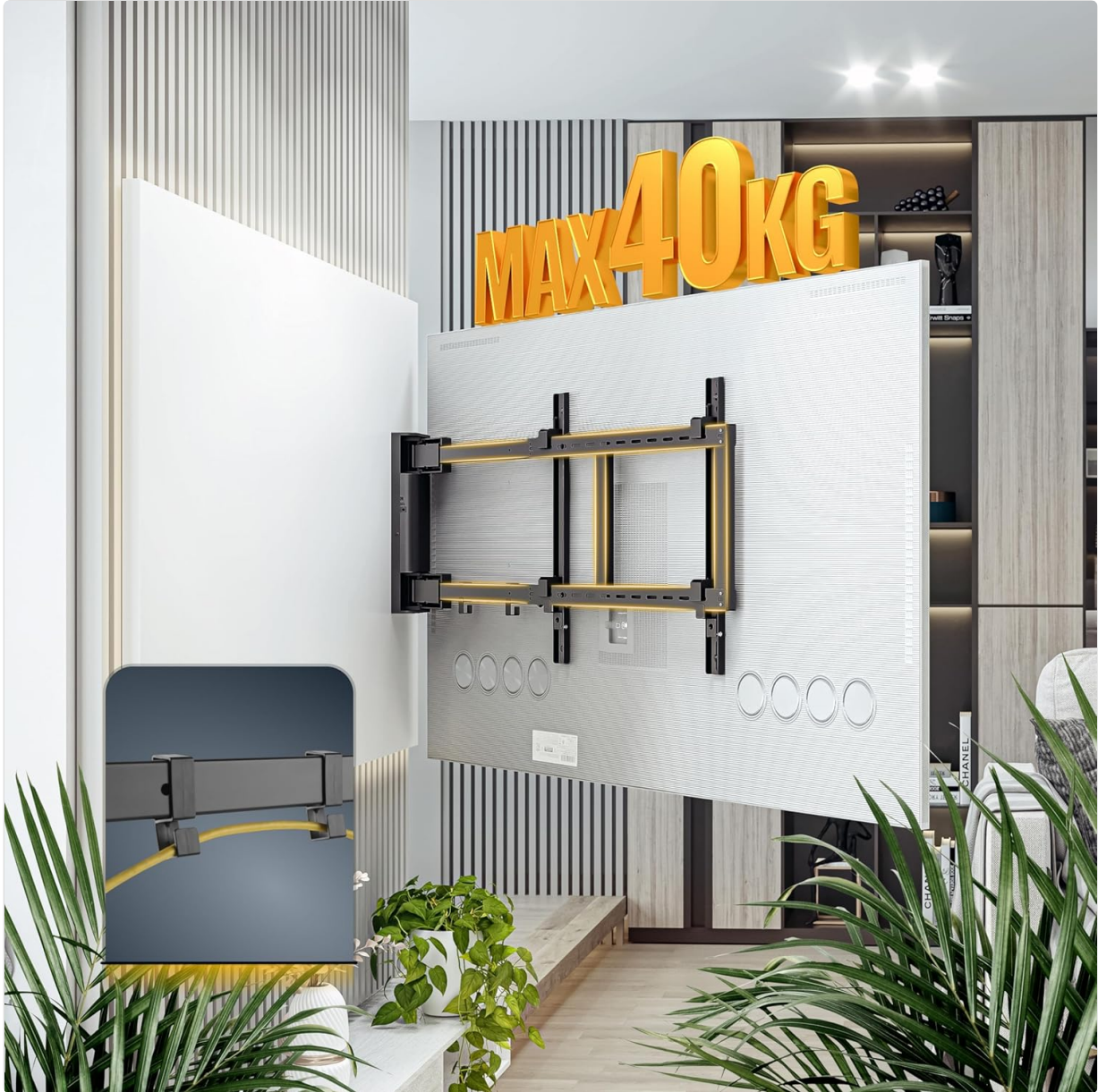
Image 3: Demonstrates the maximum weight capacity of 40kg (note: product description states 45kg, using the image's 40kg for consistency with visual) and highlights the integrated cable management feature on the mount arm.