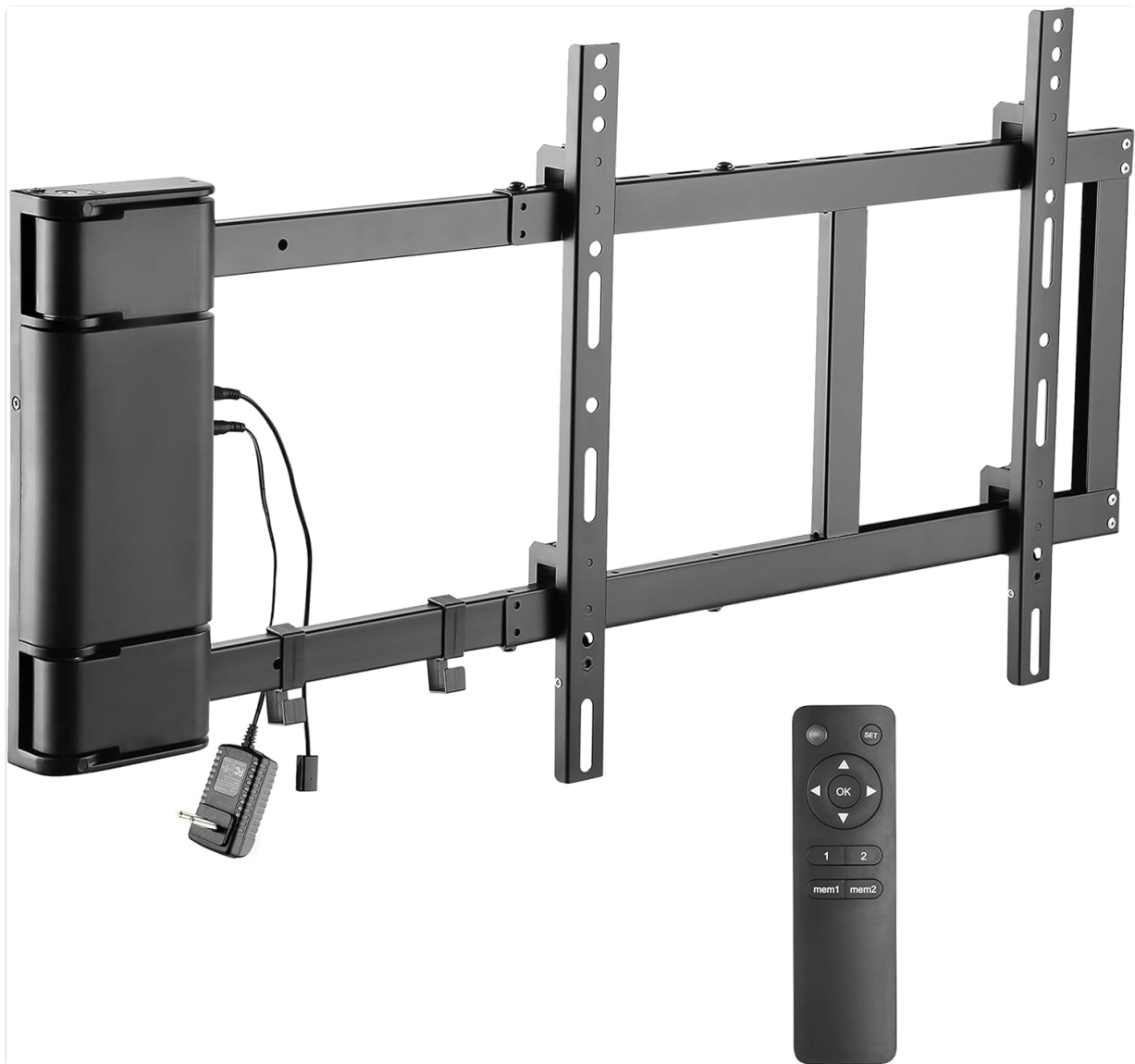
Image 1: Main components of the RICOO Electric Swivel TV Wall Mount SE2544, including the motorized arm, TV bracket, power adapter, and remote control.