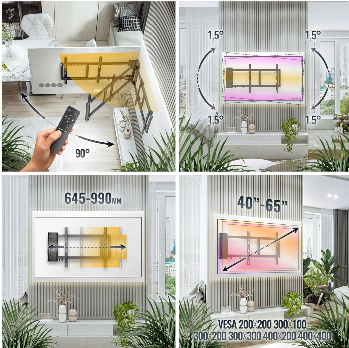
Image 4: Overview of the remote control and the mount's movement capabilities, including 90-degree swivel, +/- 1.5-degree tilt, VESA compatibility, and supported screen sizes (40-65 inches).