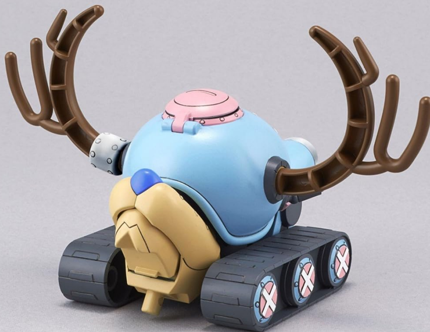
Image 3.1: Side view of the assembled Chopper Robot Tank, highlighting its profile and the details of the tank treads and cannon.