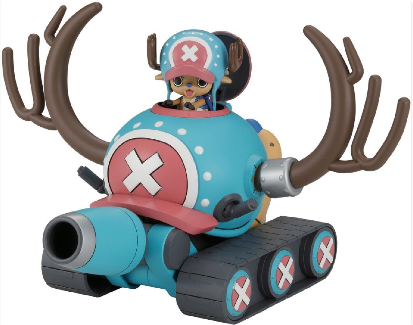
Image 1.1: Front view of the fully assembled Chopper Robot Tank, showcasing its blue tank body, large brown antlers, and Tony Chopper figure seated in the cockpit.