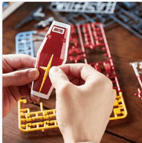
Image 2.2: A view of plastic runners (sprues) containing the unassembled parts of a model kit, ready for detachment and assembly.