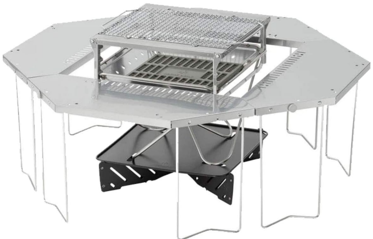
Image: An overhead view of the Jikaro Table, illustrating its octagonal design and the central space for a fire pit or stove.