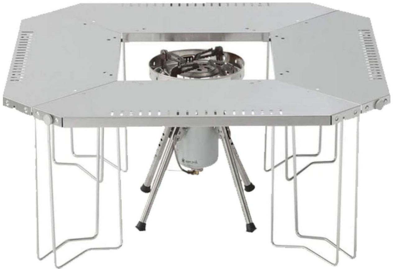
Image: The Jikaro Table with a fire pit inserted, showcasing its primary function as a BBQ table.