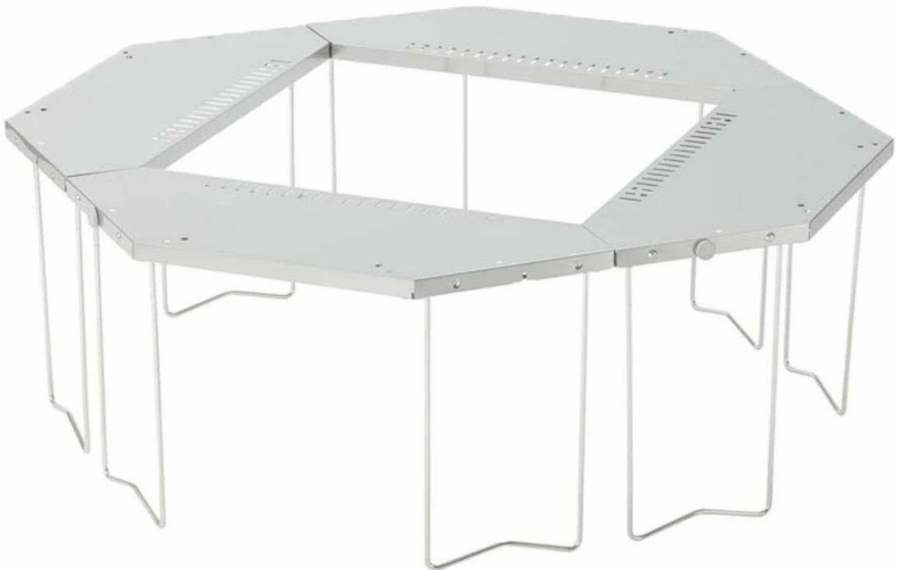
Image: Dimensional diagram of the Jikaro Table, illustrating its width, depth, and height, including the central opening size for a large fire pit.