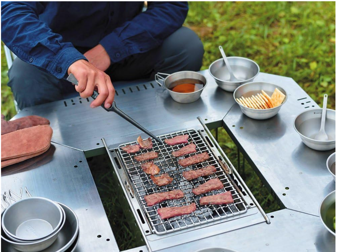
Image: Users enjoying a BBQ with the Jikaro Table, demonstrating its practical use with a central grill.