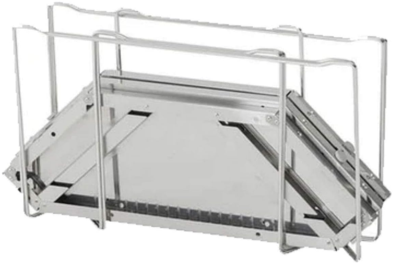
Image: The Jikaro Table folded for compact storage, highlighting its portability.