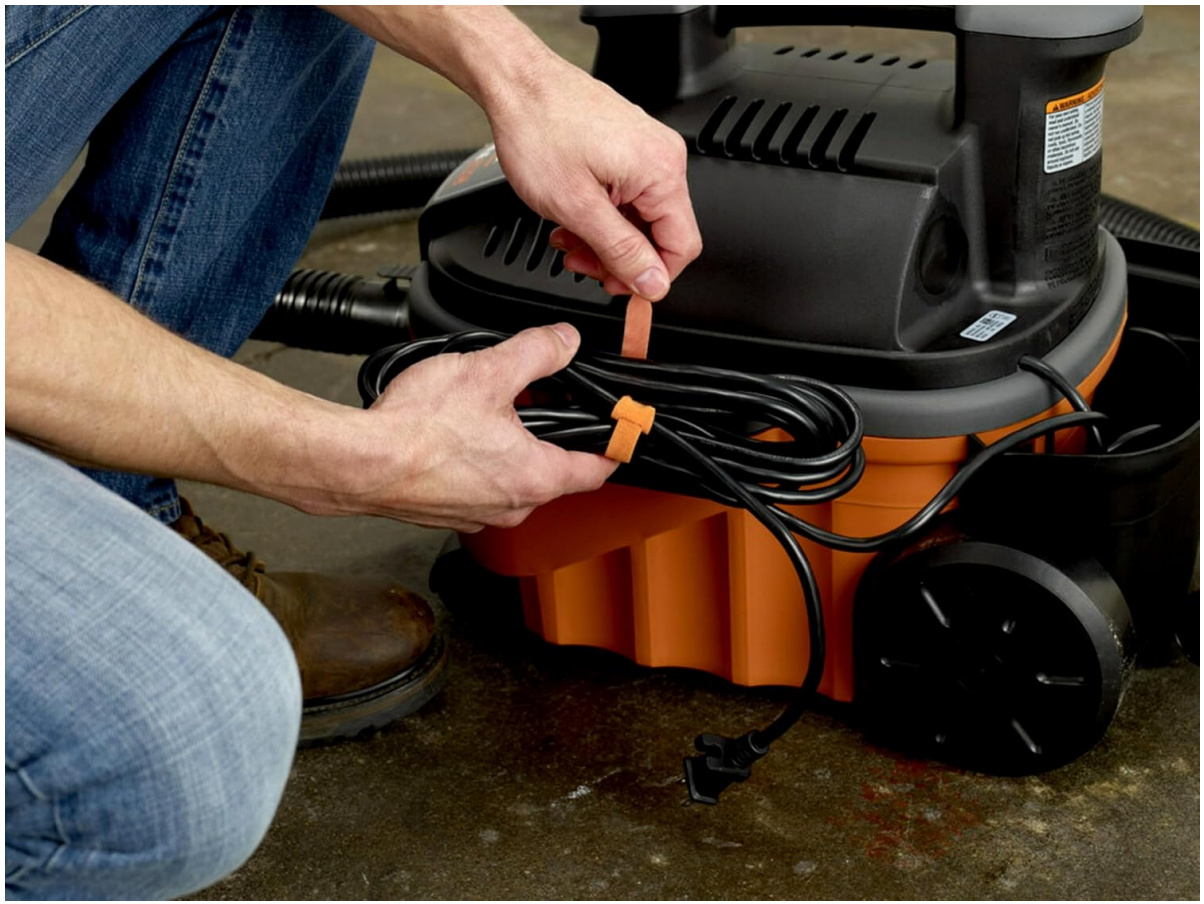
Image 3.3: Securing an electrical cord with a Scotch Bundling Strap.