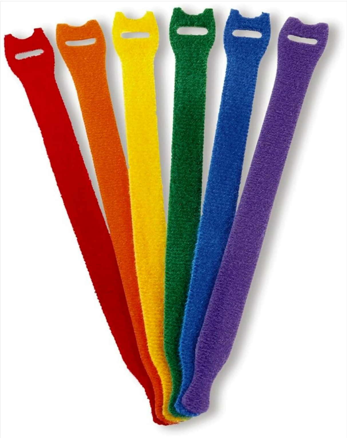
Image 3.2: Scotch Bundling Straps fanned out, showing hook and loop ends.