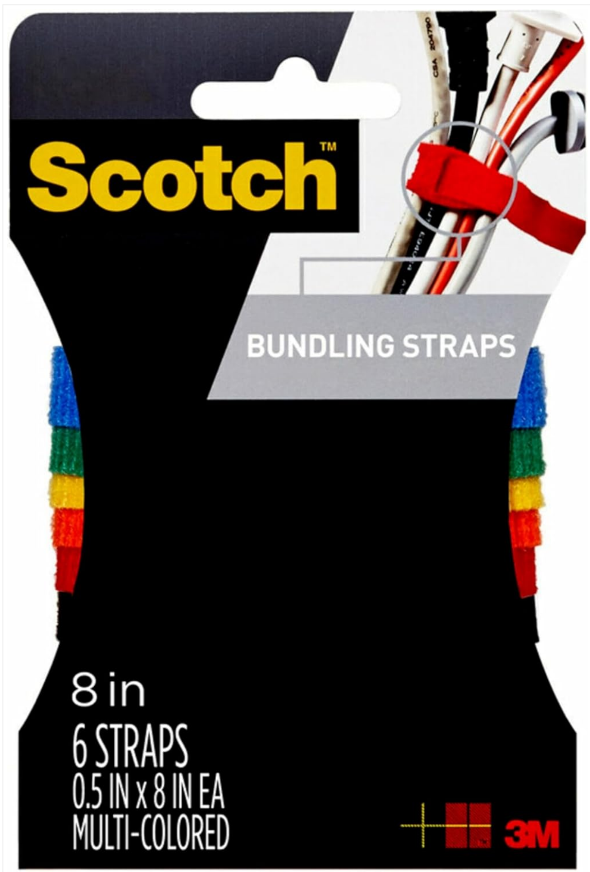
Image 1.1: Scotch Bundling Straps in assorted colors, laid out on a white background.