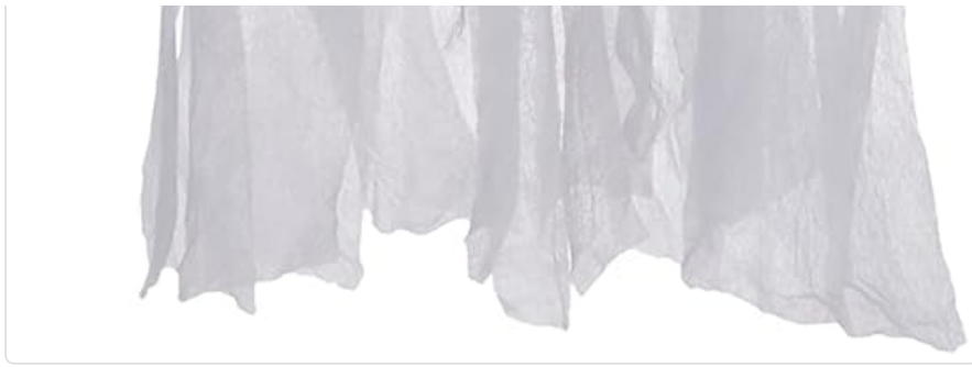
Image: The Faceless Ghost decoration, ready for display, showcasing its full form and attached chain.