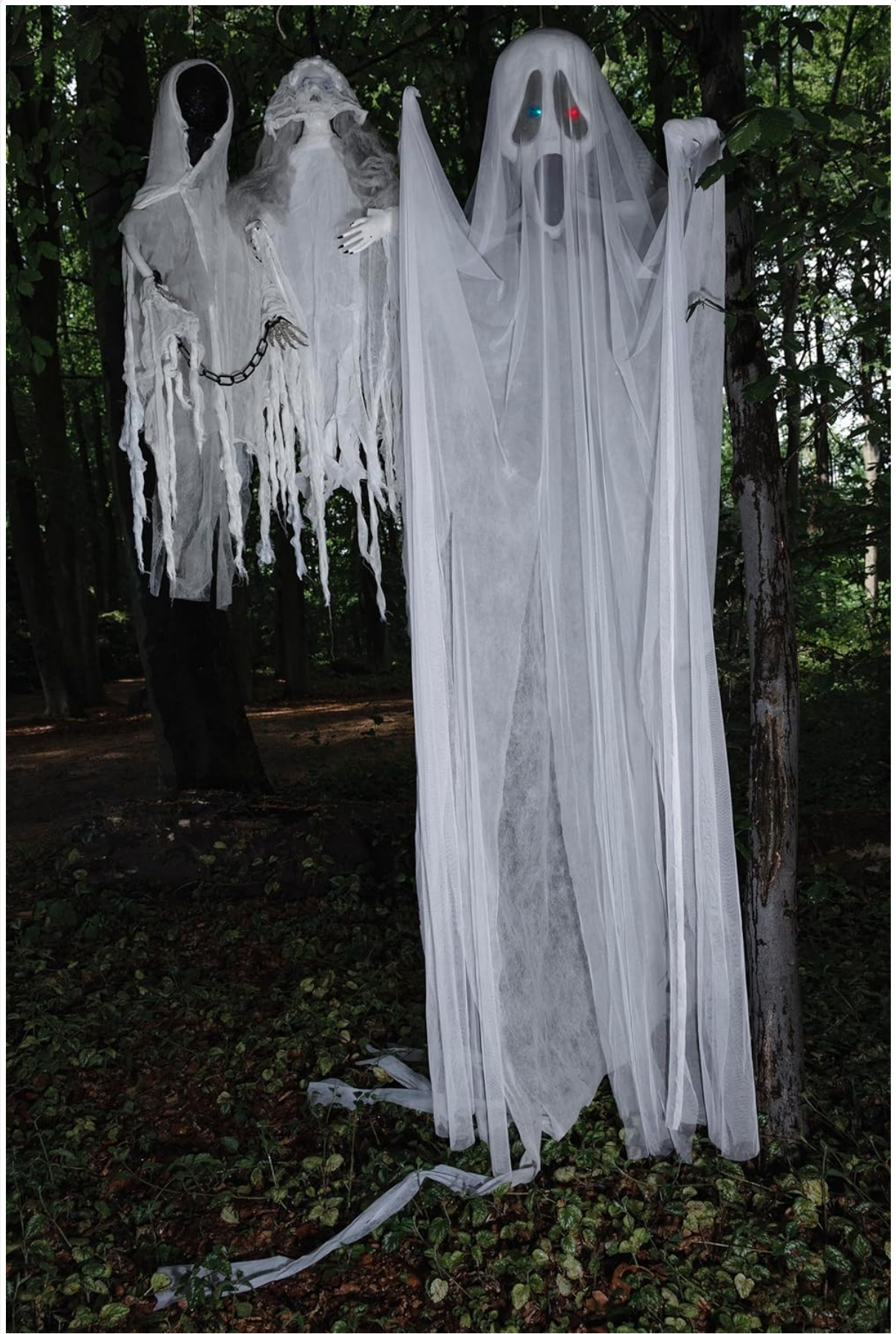
Image: The Faceless Ghost decoration displayed outdoors, hanging from a tree, demonstrating its visual impact in a natural setting.