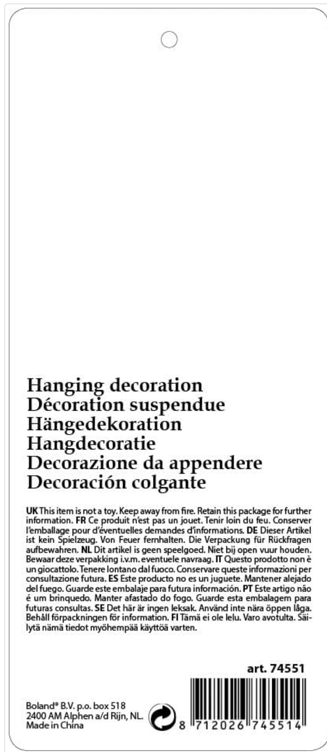
Image: Back of the product packaging, featuring multi-language safety warnings and the product barcode.