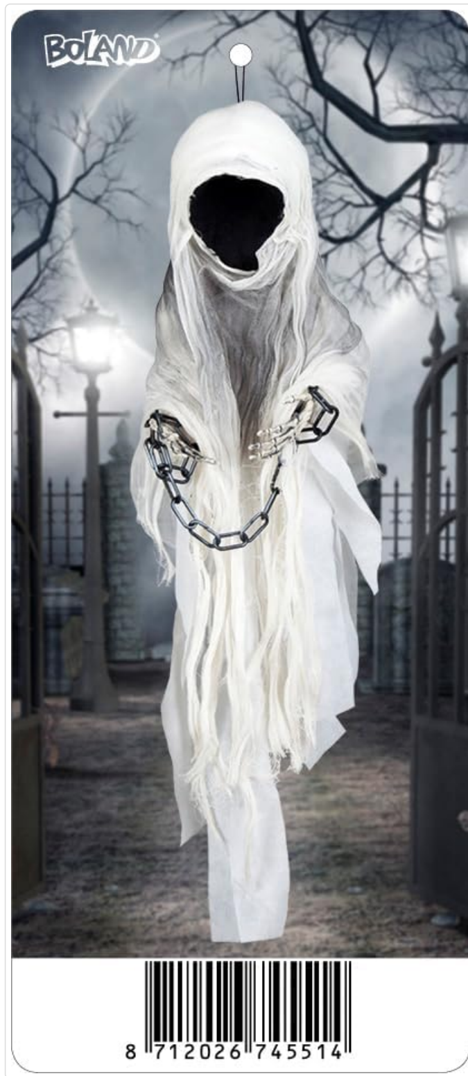
Image: Front of the product packaging, displaying the Boland logo and the ghost decoration.