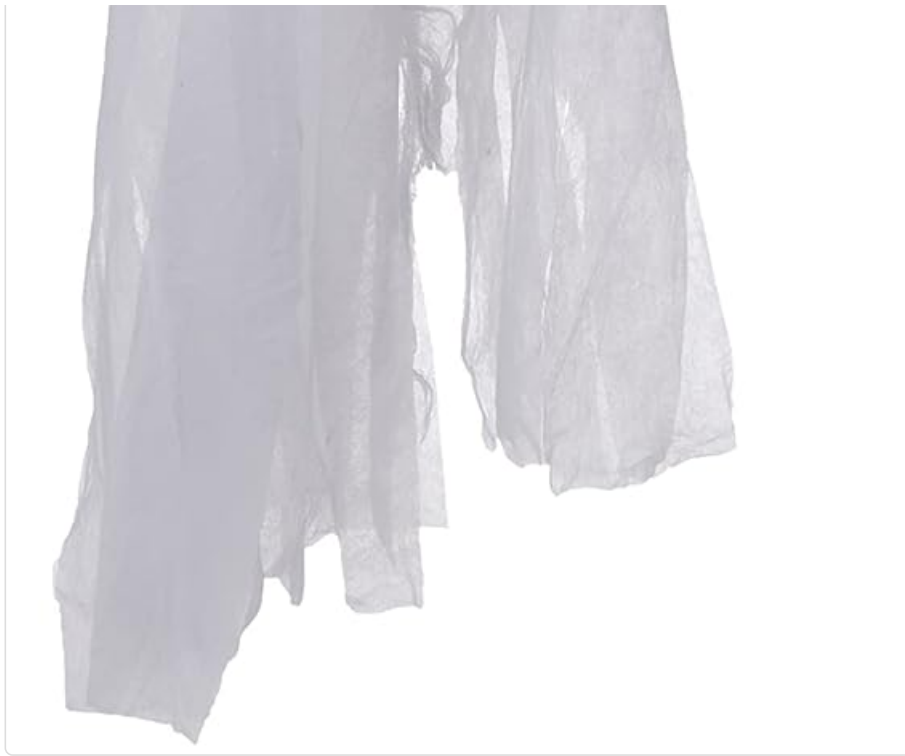
Image: A side view of the ghost, illustrating the flow of its white robe and the articulation of its skeleton hands.