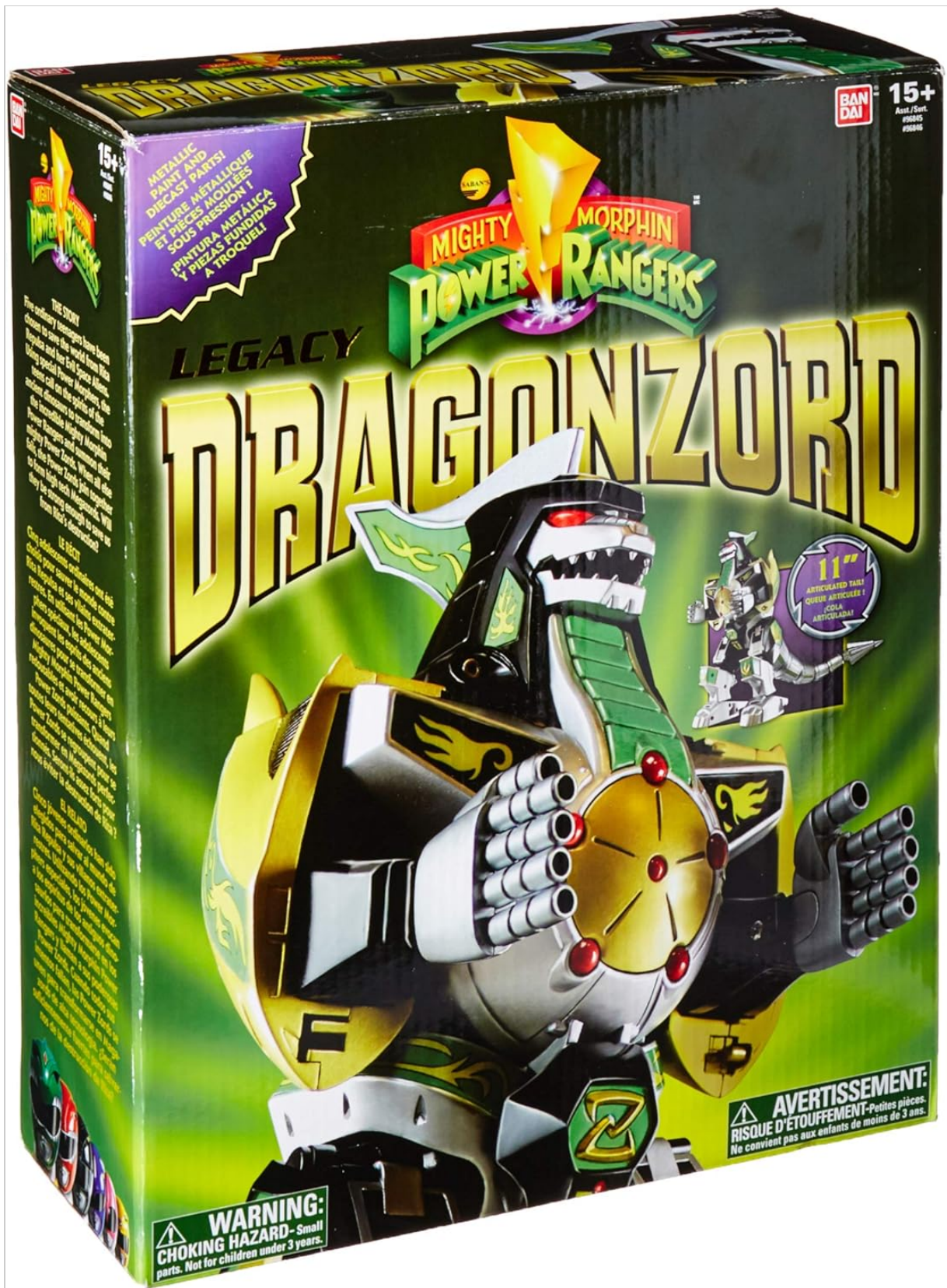
Figure 1: Front view of the Legacy Dragonzord packaging. The box displays the Dragonzord figure and highlights features like metallic paint and die-cast parts.