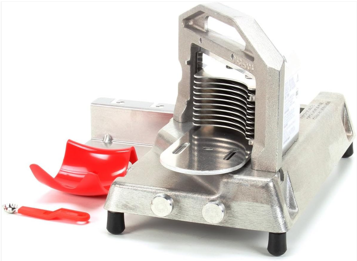
Figure 2: Angled view of the slicer, illustrating the attachment point for the red tomato holder and the cleaning tool.