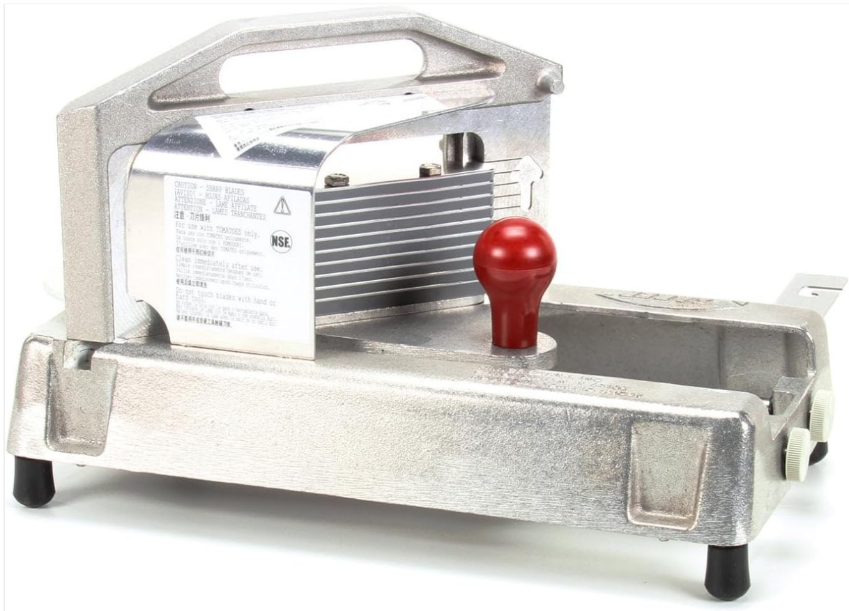
Figure 4: Rear view of the slicer, highlighting the blade guard and the main handle for transport.