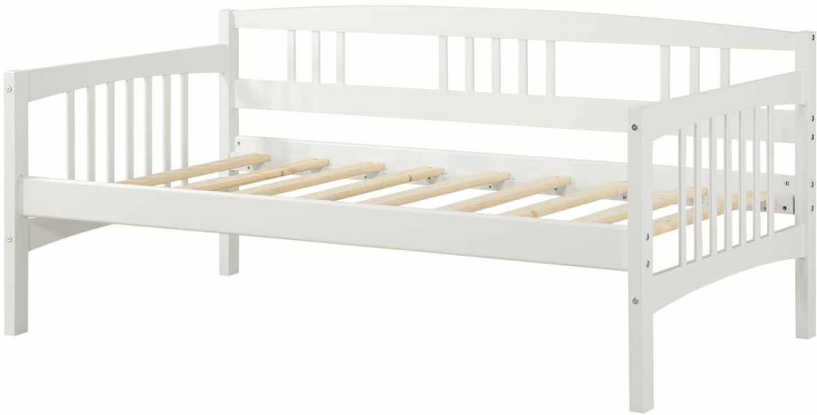
Image: Fully assembled DHP Kayden Twin Daybed.