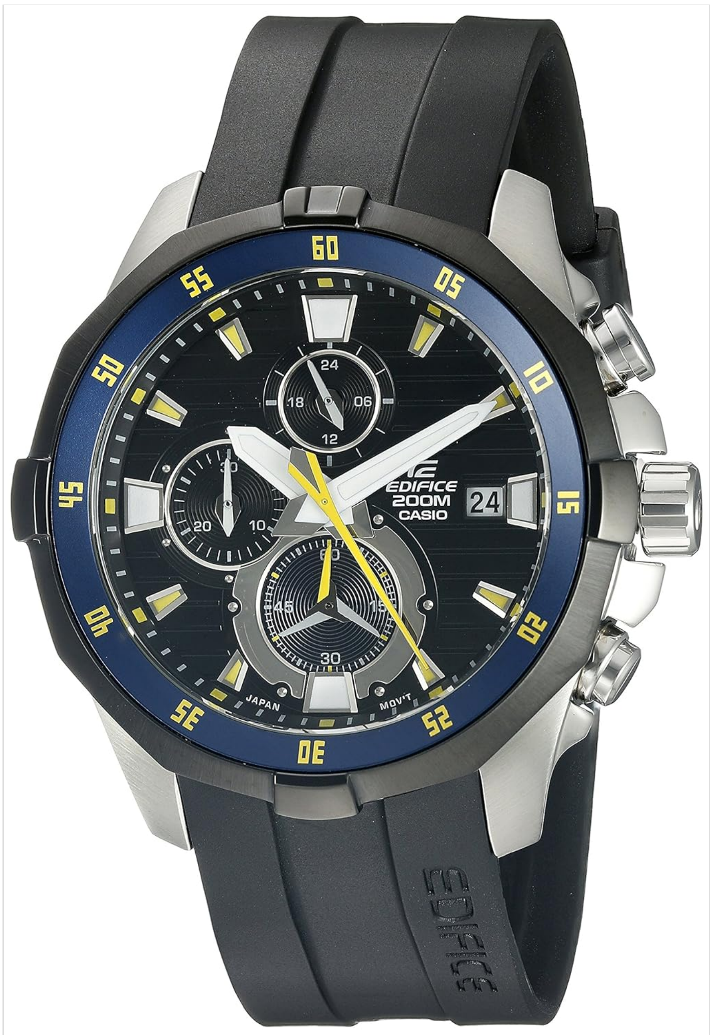
Image: Front view of the Casio EFM-502-1AVCF Edifice watch, showcasing its black dial, yellow accents, and stainless steel case with a