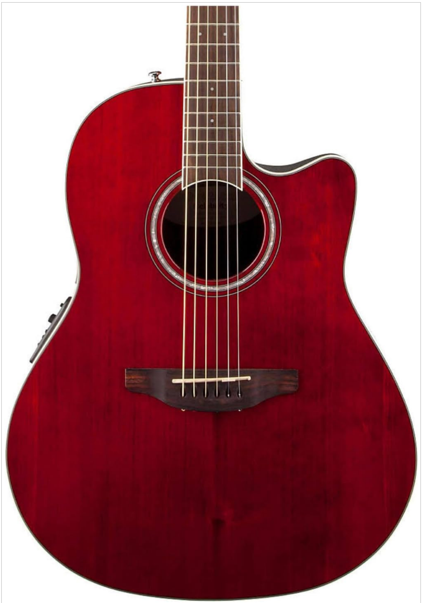
Figure 4.2.1: The Rosewood bridge and saddle, which can be adjusted for string action.