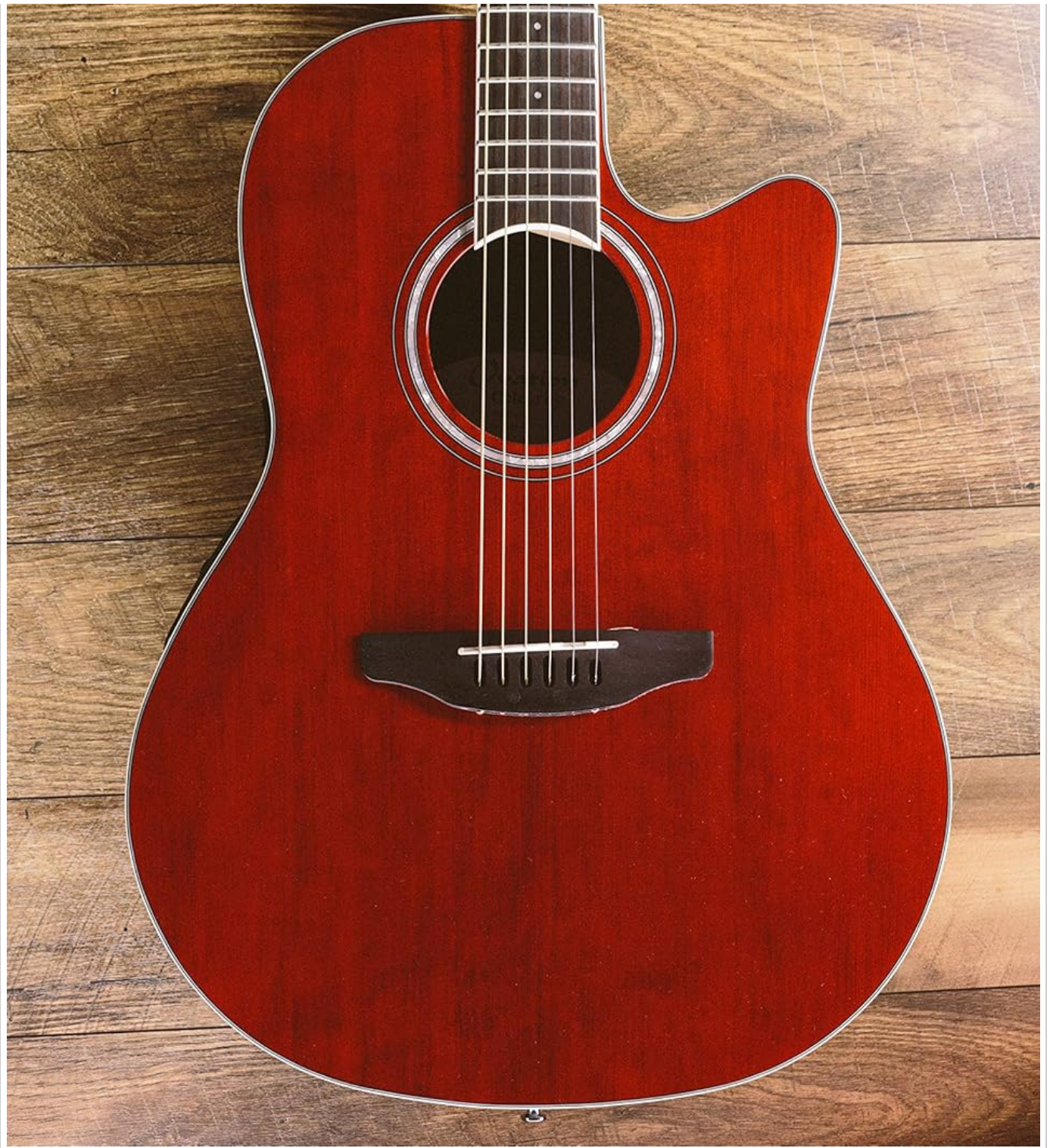
Figure 3.3.2: Close-up of the soundhole with pearloid rosette, showcasing the instrument's aesthetic details.