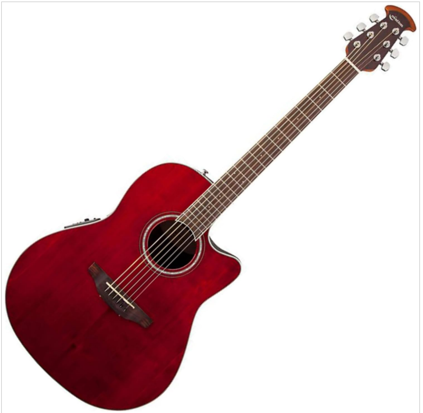
Figure 3.3.1: Headstock with Chrome Die-Cast Tuning Machines. These machines ensure stable and precise tuning.