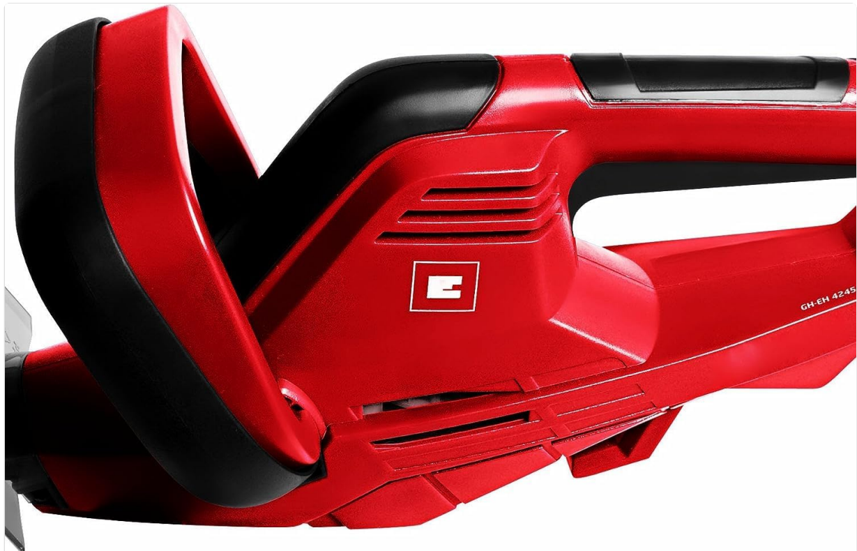
Figure 1: Main view of the Einhell GH-EH 4245 Electric Hedge Trimmer, highlighting its ergonomic design and blade assembly.

Familiarize yourself with the components of your Einhell GH-EH 4245 Electric Hedge Trimmer.