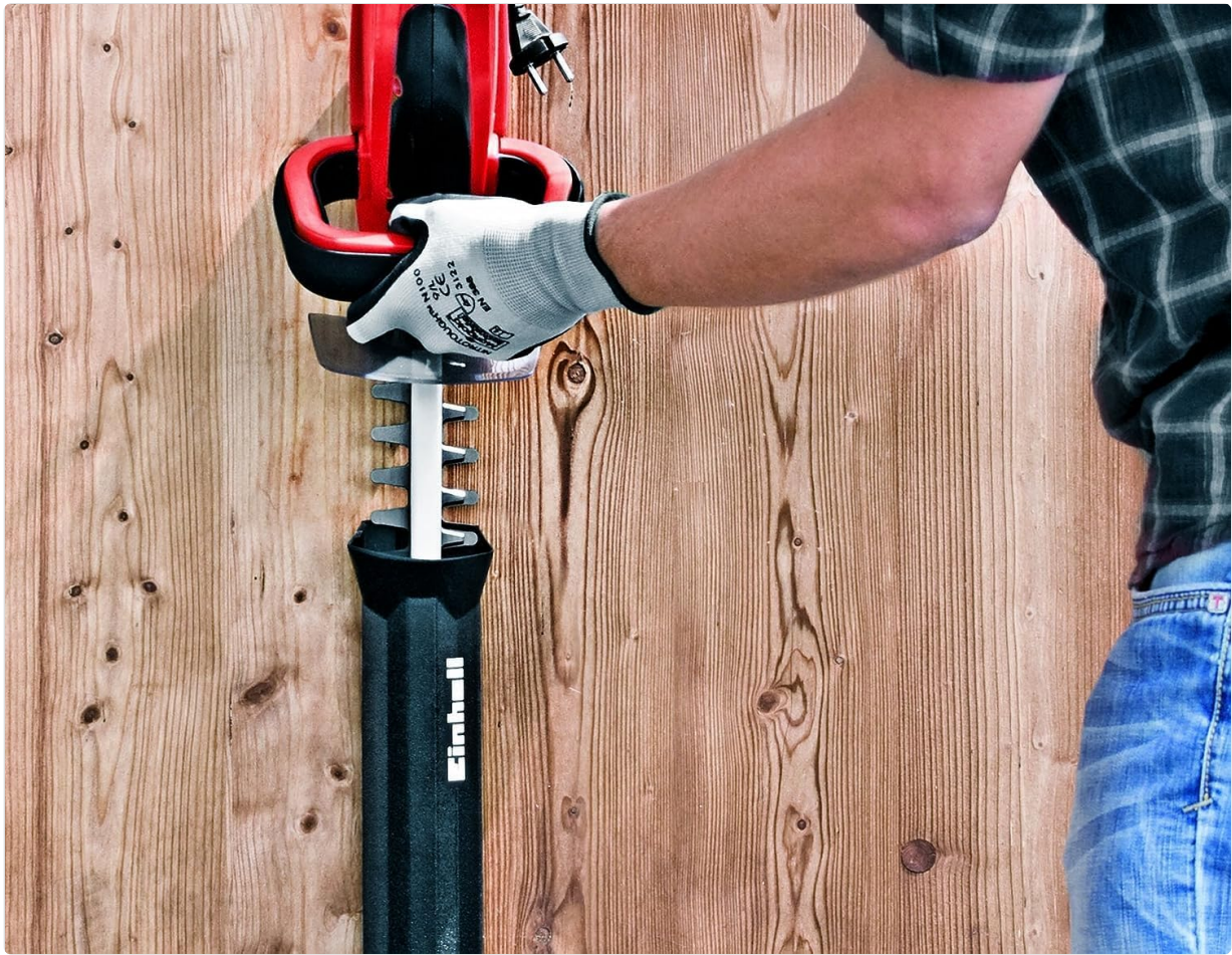
Figure 9: The hedge trimmer can be conveniently stored using a wall bracket, keeping it safe and organized.