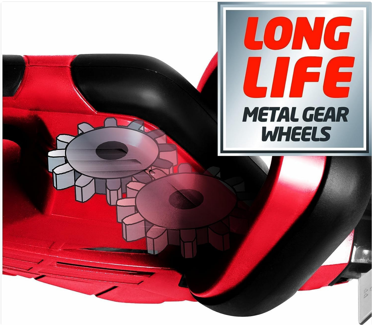
Figure 8: Internal view illustrating the robust metal gearing designed for extended product life.