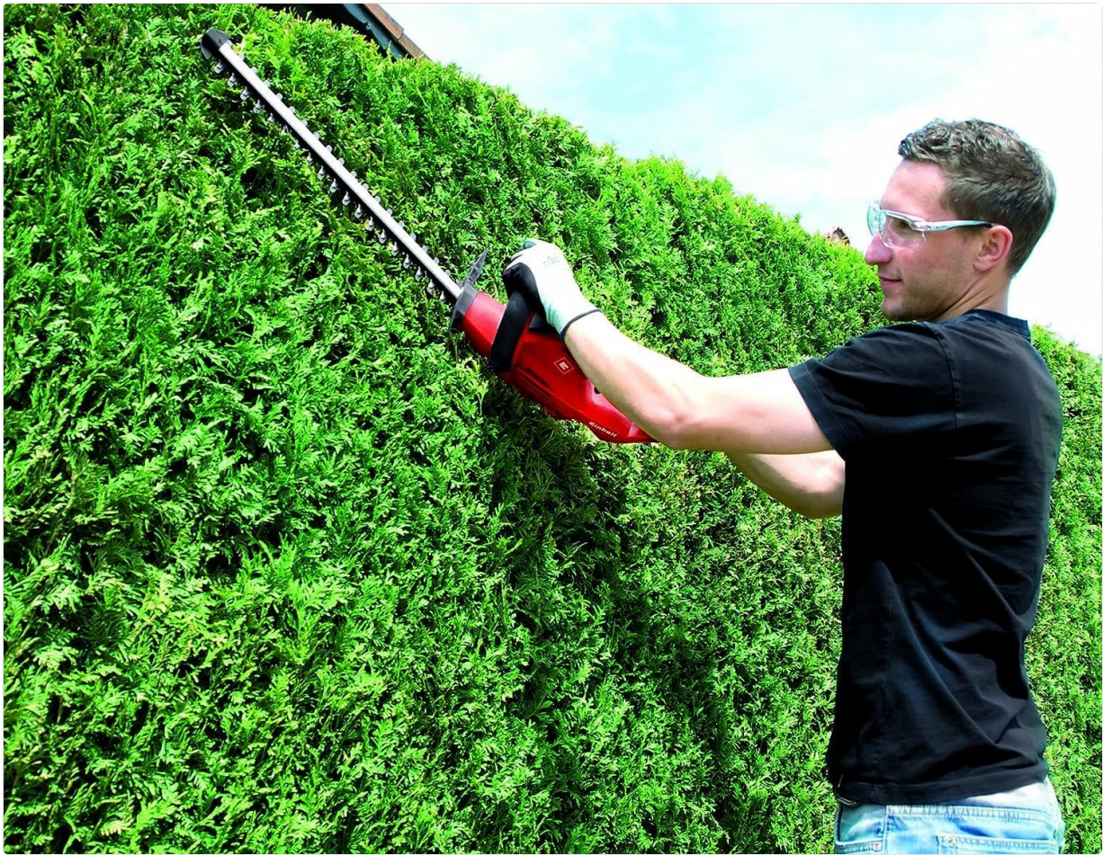
Figure 4: Demonstrating the hedge trimmer in use, showing a user maintaining a hedge.