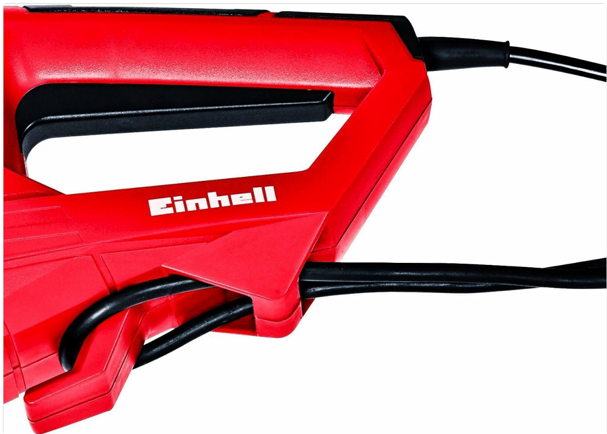
Figure 2: The cable strain-relief clip ensures the power cord remains securely attached and prevents accidental disconnection.

Connect the hedge trimmer to a suitable power outlet. Ensure the power cord is securely routed through the cable strain-relief clip to prevent accidental disconnection during operation and reduce stress on the connection point.