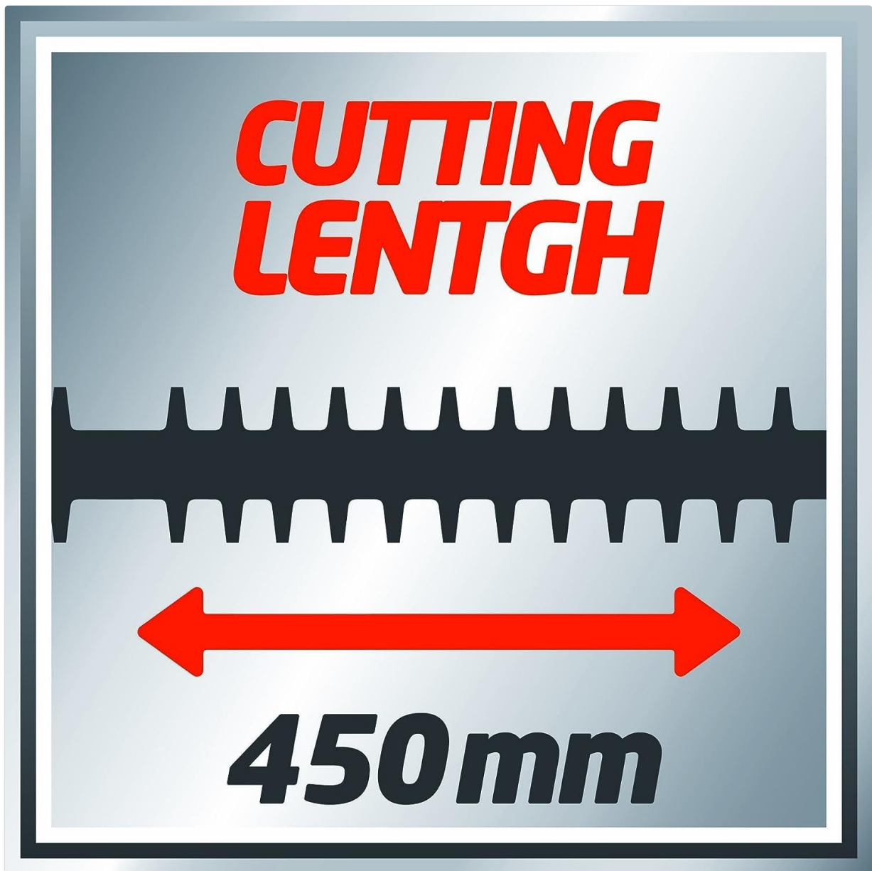
Figure 6: The cutting length of the blades is 450mm, suitable for various hedge sizes.