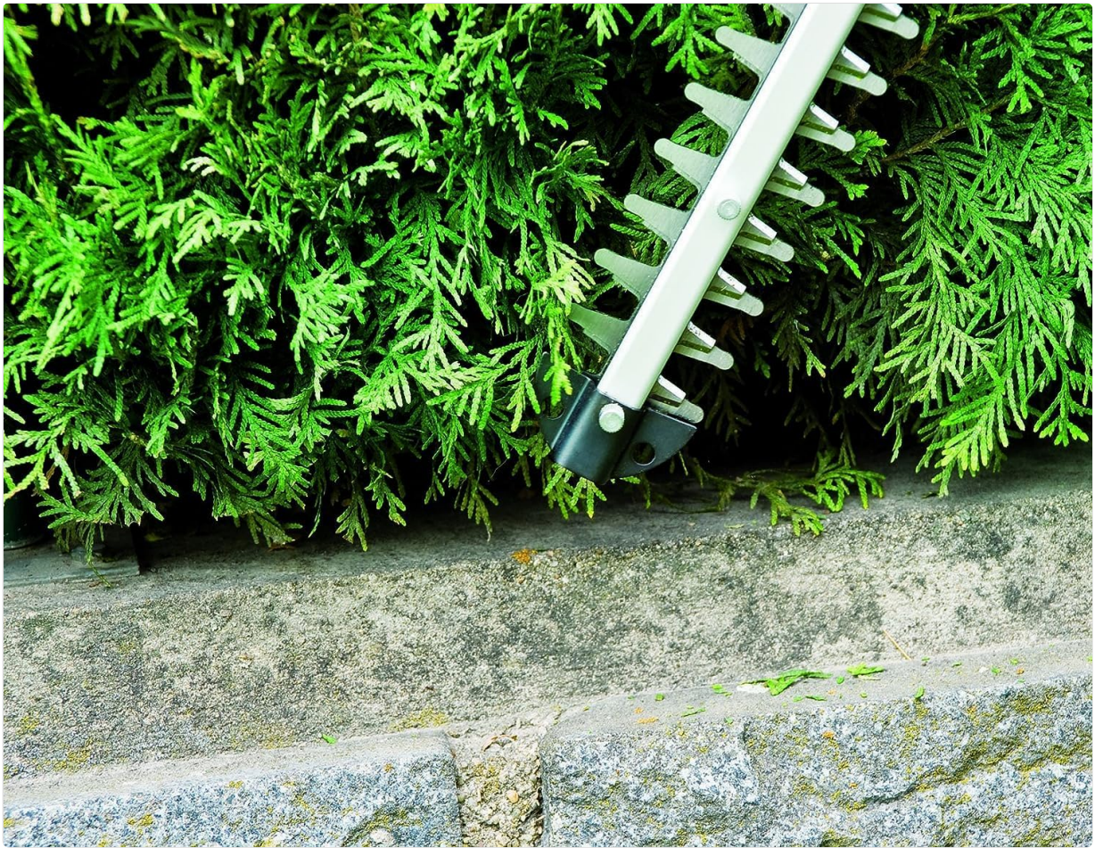
Figure 7: Illustrates the hedge trimmer blade operating near ground level, emphasizing the need to avoid contact with hard surfaces.